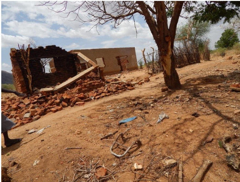
Six children were killed in this house on 16 October 2014 in Heiban town, Heiban County

Children have frequently been killed and injured in attacks in South Kordofan. On 16 October 2014, a bomb hit a house in the village of Heiban in Heiban County in which seven children between the ages of five and 12 were hiding. Six of the children were killed immediately or died shortly after the attack from their injuries. Only one child survived the injuries sustained during the attack. The children's mother was farming in a nearby field at the time.