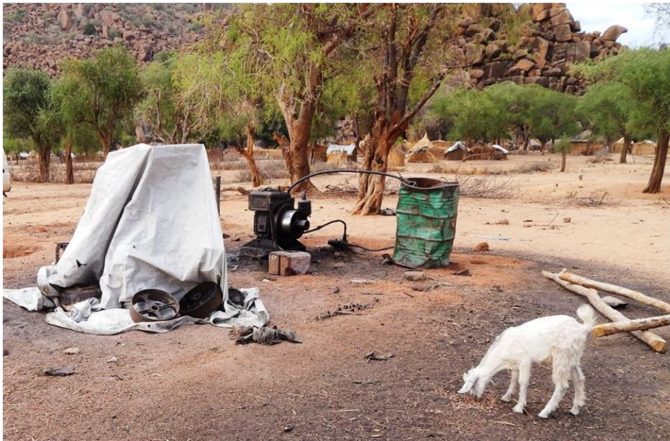
The site of the grinding mill in Tunguli, Dalami County, attacked on 7 April 2015