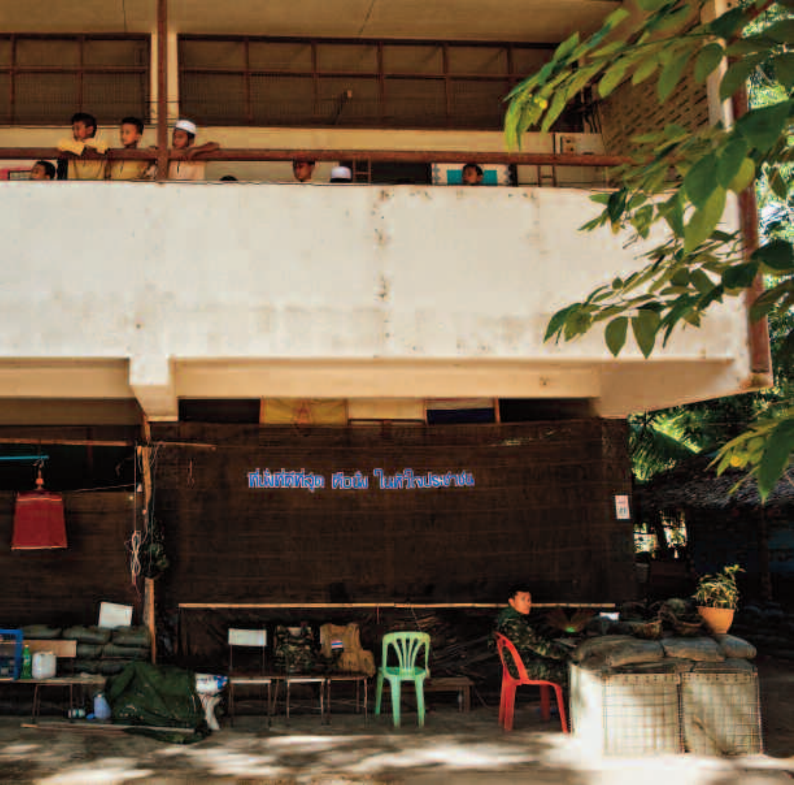
Students at Ban Klong Maning Elementary School, Pattani, wait outside their classroom as a soldier from a “Peace and Development” infantry unit guards the rooms on the ground floor that are occupied by his unit.