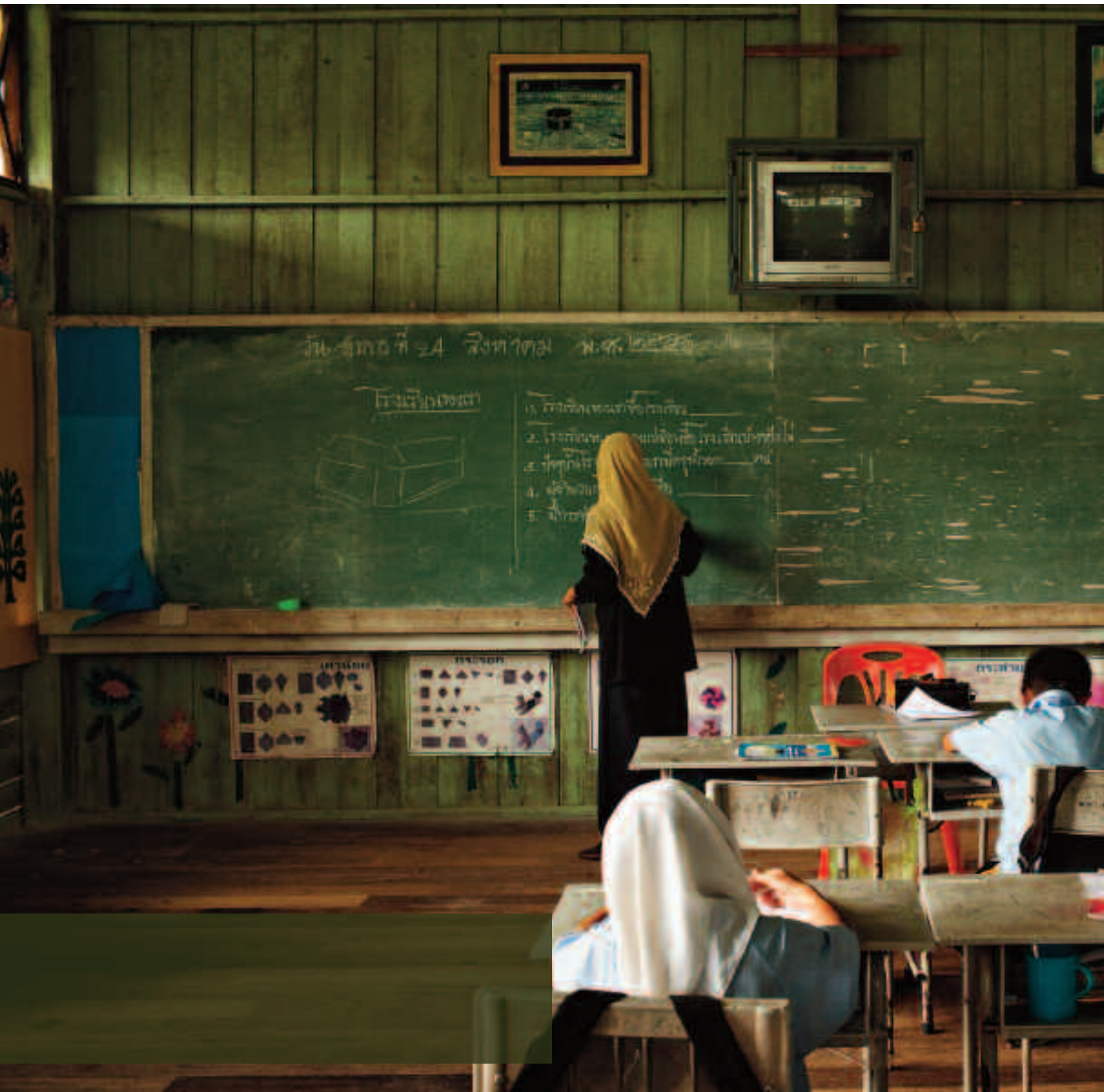
A teacher and students at Ban Klong Chang Elementary School, Pattani. A local resident told Human Rights Watch that approximately 80 students had left the school after paramilitary Rangers established a base at the school; approximately 90 students remain.