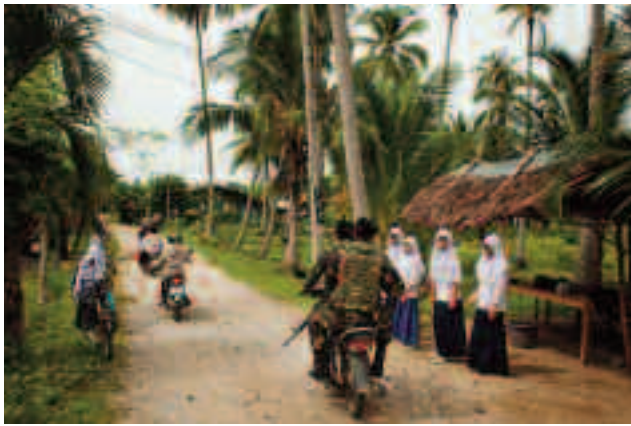
(above) A convoy of teachers, escorted by the army, passes by students as they leave school.

(right) A teacher shows the gun he says he always carries, even when teaching, at Ban Klong Chang Elementary School, Pattani. The teacher said he had narrowly escaped two attacks by insurgents and that he was afraid for his life. Parents and students said teaching quality has decreased due to increased anxiety and security concerns of the teachers. “The teachers are not focusing on the teaching,” one mother said.