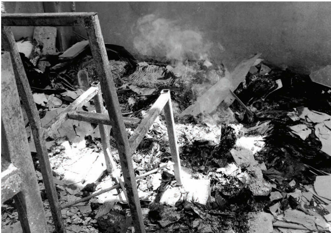
Figure 4: Burning books continue to smolder in the library at Ban Ba Ngo Elementary School, Pattani, five days after insurgents set fire to the school on March 19, 2010.

Describing how the teachers felt following the attack, one teacher explained that they were “[t]errified. But if we left, then the children would have no teachers.” 177