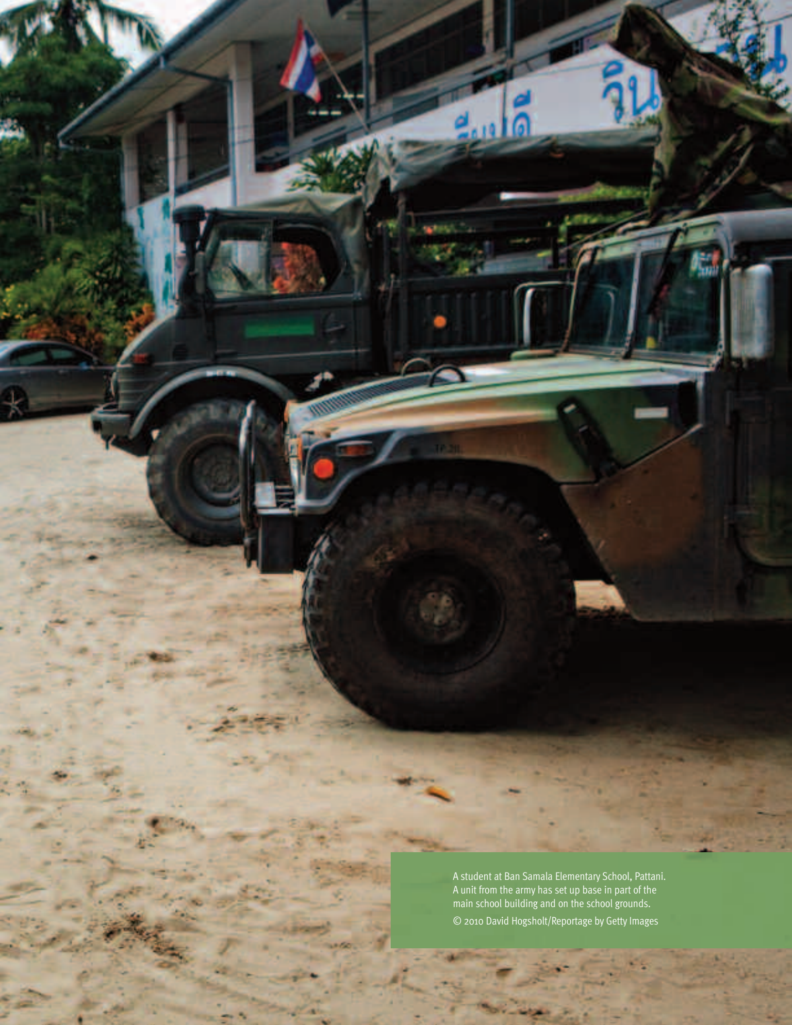
A student at Ban Samala Elementary School, Pattani. A unit from the army has set up base in part of the main school building and on the school grounds.