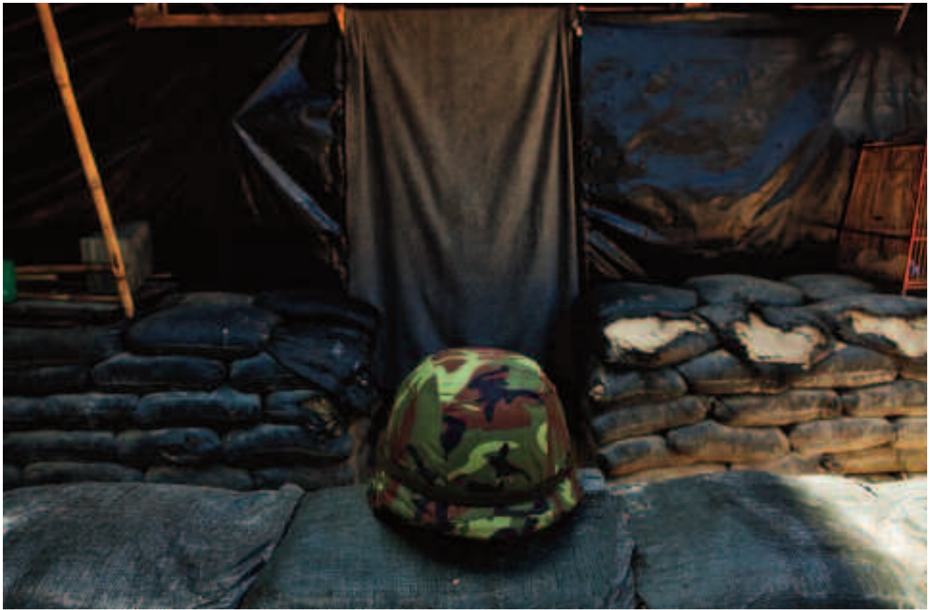
A helmet sits on a sandbagged wall of the barracks housing 26 soldiers at Ban Samala Elementary School, Ban Samala.