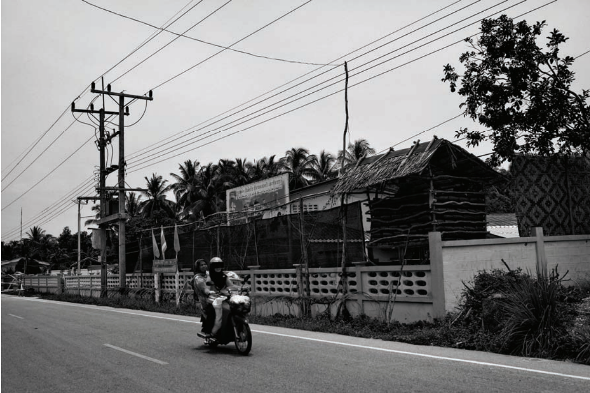
Figure 3: Paramilitary Rangers have built two watchtowers to fortify the base they established in November 2007 within the grounds of Ban Paka Cinoa Elementary School Pattani.

In two cases investigated by Human Rights Watch, security procedures the government forces introduced at the school limited civilian access to the school, including preventing parents from entering the school compound. 157