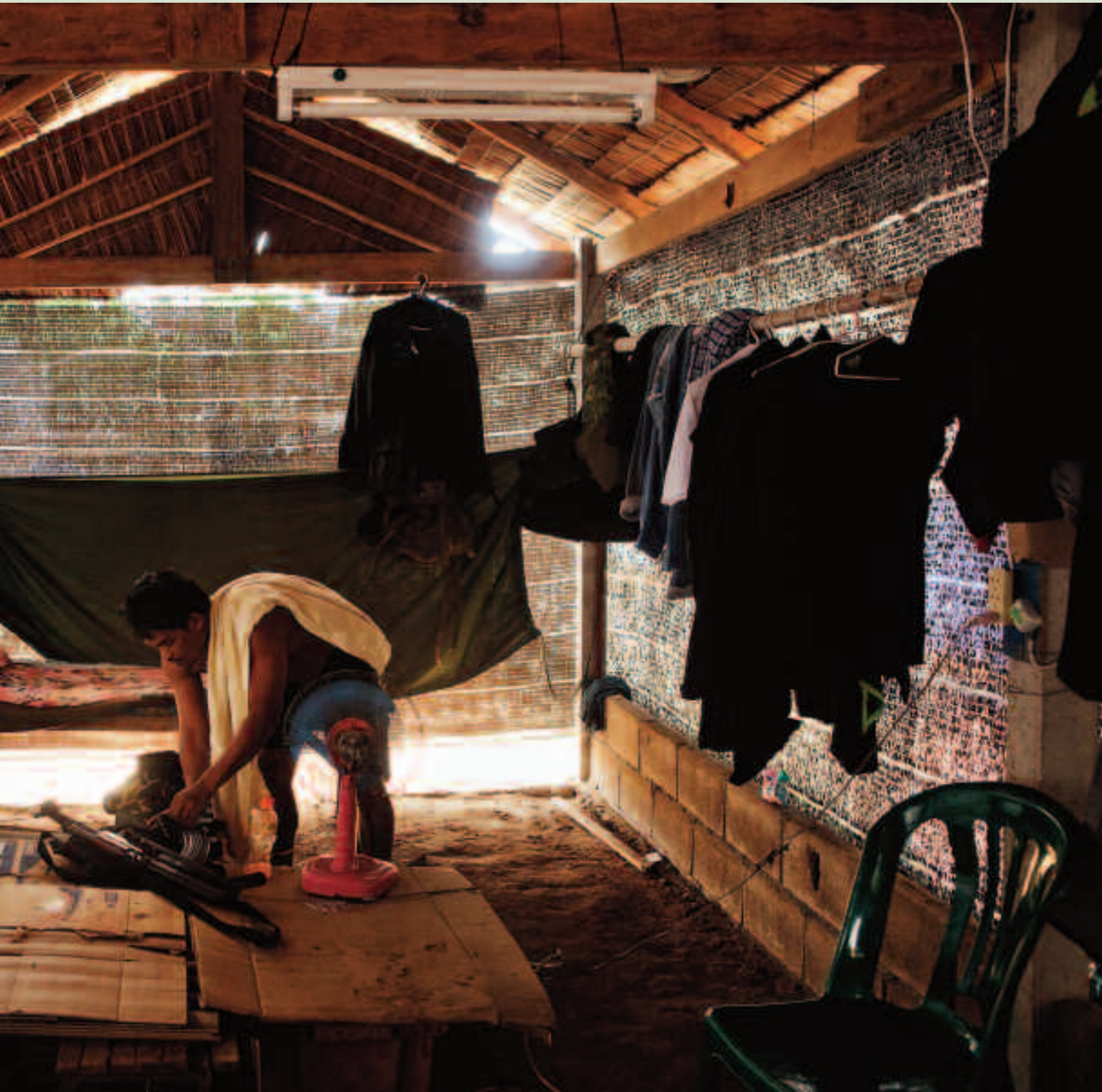
A Thai Ranger tidies up a barrack in the compound of Ban Paka Cinoa Elementary School, Pattani. Approximately 25 Rangers from a “Peace and Development” unit are based on the school grounds.