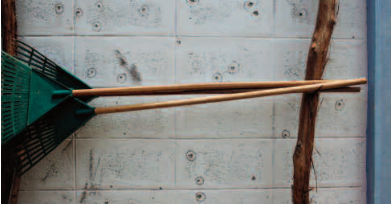
(above) Bullet holes on the inside of the wall of Ban Paka Cinoa Elementary School in Pattani. Paramilitary Rangers based in the school compound came under heavy attack by insurgents using gunfire, improvised explosive devices, and grenades in 2010.

The loss of school buildings disrupts children's access to a quality education, saps scarce school resources, and generates fear among teachers, children, and their parents. Students displaced from their classrooms often meet in crowded tents or other prefabricated units in the school playground. Teachers and students told Human Rights Watch that these temporary teaching conditions cause problems for the children, as they can be crowded and noisy, and in certain weather conditions, overly hot or wet. The impact is often felt beyond the targeted school, as neighboring schools are often temporarily shut down following an attack.