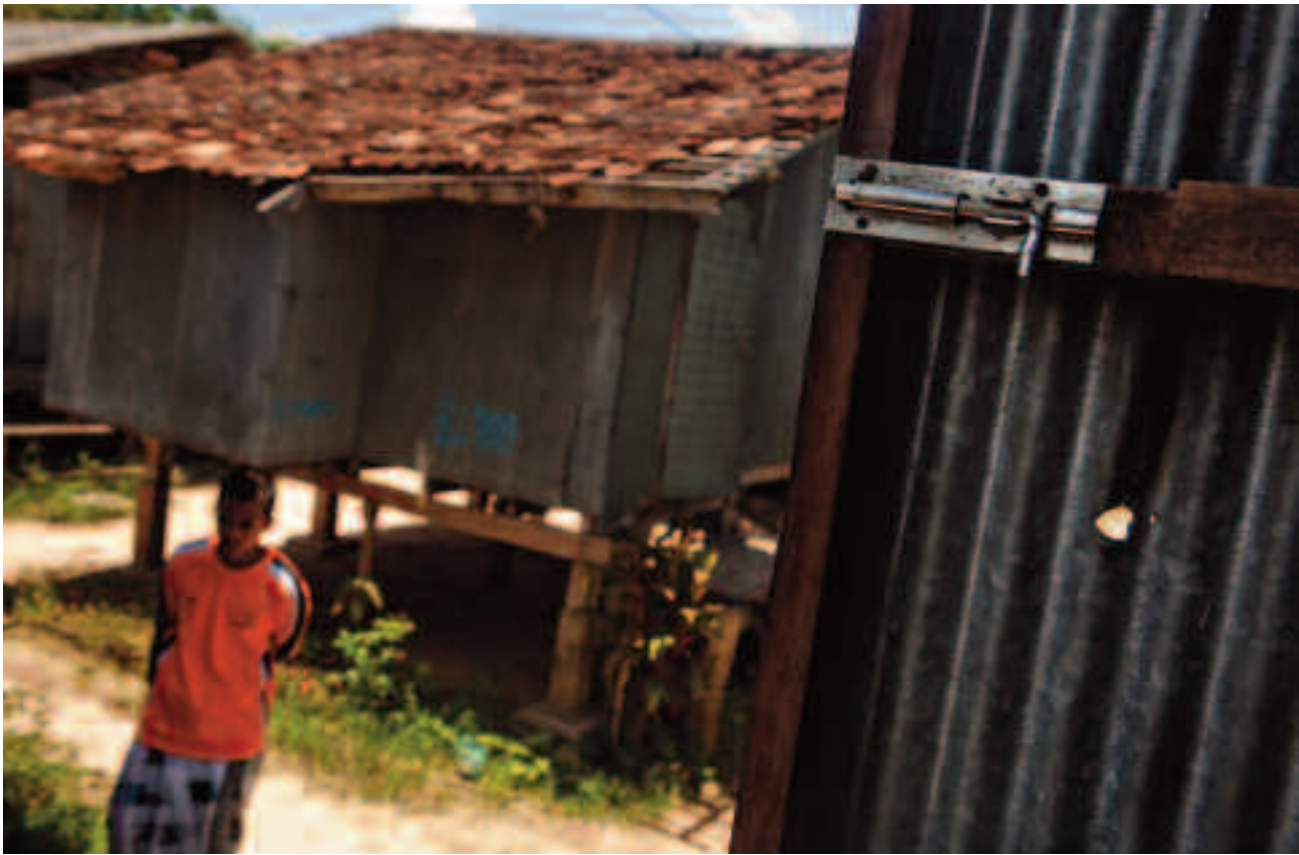
A bullet hole is visible in the door of a residential hut in a pondok , an Islamic school, in Yala. Paramilitary Rangers raided the pondok while looking for an insurgent.