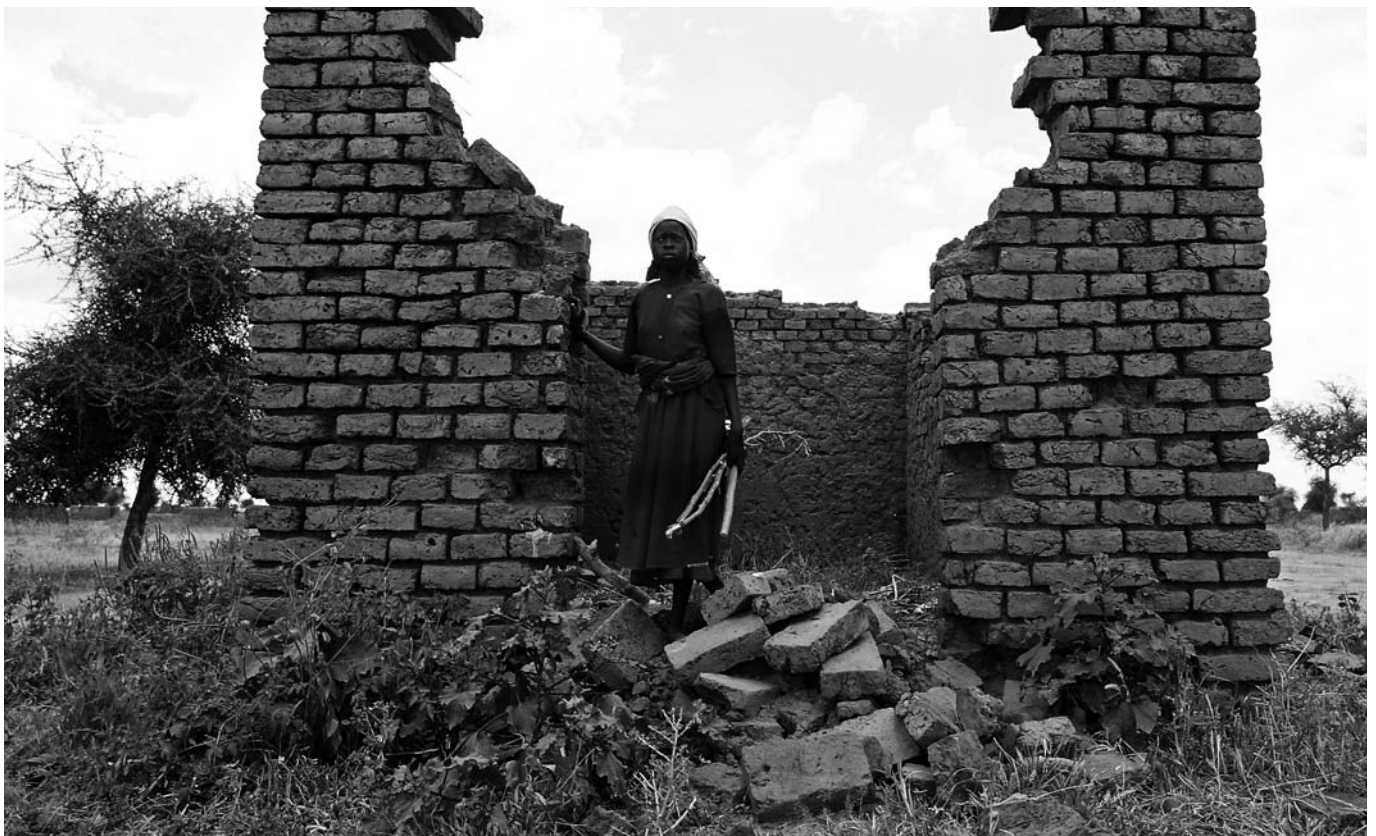
A displaced Sudanese girl from the Fur tribe stands among ruins at a destroyed village near Kass, South Darfur.

The longer Darfur's conflict goes on, the more complicated is the task of ending fighting, resolving