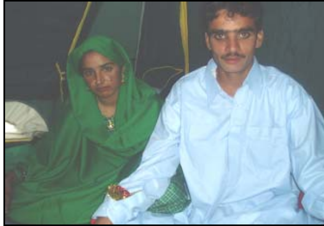
Young married couple on their wedding day (Al Fajir Camp, Gari Dupatta, AJK)

The social fabric is distorted. However, people are rebuilding it, new relationships are emerging giving hope for the future. The following reflects this situation.