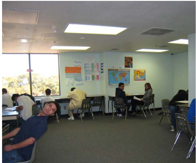
The quality—and quantity—of education varies between DUCS program sites. Here, children study at the Abraxas Hector Garza Center in San Antonio, Texas.

training or vocational training. Many of the children expressed a desire for more English language instruction. In addition, most facilities lacked age-appropriate books or magazines for children in their native languages.