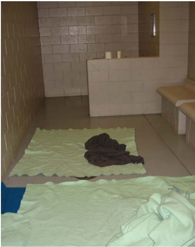
Children held at the Fort Brown Border Patrol facility sleep on cold floors, with minimal bedding.

There are no appropriate sleeping accommodations for children in Border Patrol stations. Like adults, children sleep on cold floors, thin mats, plastic sheets, cement benches, newspaper or plastic “boat beds.” At El Paso and Ft. Brown, most children are provided with blankets, but at the Harlingen substation children received no blankets at all. When we asked why they had none, agents told us that the station used to provide them, but that the blankets became infested with bugs because the children were so dirty. The blankets were discarded. 64 Children at stations where blankets are provided confirmed that the blankets were dirty; one child stated that she did not use the blanket she was given because it had bugs on it. 65