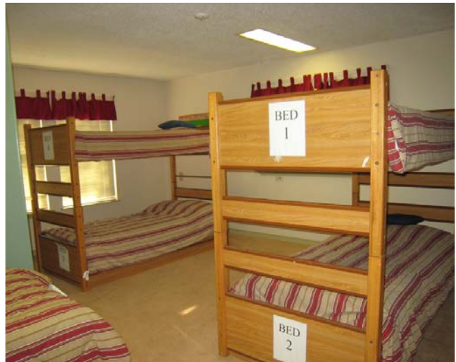
A bedroom at the Baptist Child and Family Services (BCFS) shelter, an ORR facility, in San Antonio, Texas, has a more dorm-like feel.

DUCS uses a range of facilities from foster care, to group homes, shelters, staff-secure and secure facilities for the placement of children. (See Appendix F for additional information.) While DUCS has expanded the use of foster care and decreased the use of secure facilities (discontinuing agreements with 31 secure facilities used by the former INS), 133 a lack of clarity and consistency in placement decisions has sometimes resulted in an overuse of staff-secure and secure facilities. Some staff-secure and, particularly, secure facilities are, or closely resemble, juvenile correctional facilities, and are characterized by constant observation from staff and increased structural security. Staff-secure and secure facilities are wholly inappropriate for most 134 unaccompanied children because they are based on a correctional, not a child-welfare, service model and