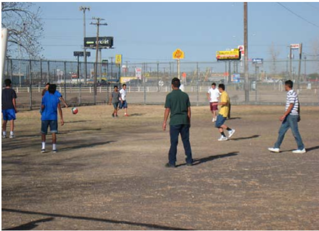
Boys play at the Baptist Child and Family Services (BCFS) shelter in San Antonio, Texas.

care settings is dependent on the level of engagement and resources available to individual families.