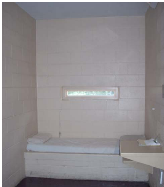
A bedroom at the Southwest Indiana Regional Youth Village (Vincennes), Indiana, is reminiscent of a prison cell.

The problem of these larger, more impersonal facilities and their impact on safety and care is particularly pronounced in staff-secure and secure facilities. (See Appendix F for definition of secure and staff-secure facilities.) In the year we conducted most of our field research, 108 DUCS opened new secure and staff-secure facilities. In part this was a response to the growing number of children referred to DHS from law enforcement. 109 However, DUCS increasingly places children with behavioral and mental health problems in staff-secure and secure facilities, rather than therapeutic programs. Many of these facilities do not yet have adequate staffing in place to handle the increased population, prompting concerns from staff and attorneys about the facilities' ability to meet the complex needs of the children. 110 At the time of our visit to the Northern Virginia Juvenile Detention Home (NOVA) in Alexandria, Virginia, the facility had no daily staff members on site who were trained in DUCS policies and procedures. 111 Rapid population growth seems to have contributed to abuses that developed at both the