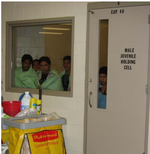
Boys held in a cell at the Border Patrol's Fort Brown (Texas) station.

inal backgrounds that would justify ICE's retention of custody over these children. 45 Custody of unaccompanied children with criminal convictions was further clarified by the TVPRA, which provides that unaccompanied children charged with having committed a criminal offense should be in DUCS custody, and may be placed in a secure DUCS facility.