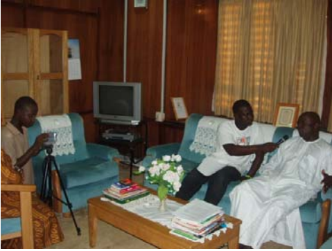
Interview with minister

There is a need for a youth policy to coordinate all youth programmes in Ghana. This policy should clearly define the needs of young people as a heterogeneous group. There is a clear need for HIV/AIDS information to be packaged for in and out-of-school youth, rural and urban youth, infected and affected youth, etc. Currently there is no clear segregation in this area, but a mistaken implication that young people are not sexually active. Presently there is a diversity of youth programmes from various sectors. A coordinated approach would create a pool of funds and activities and distribution of roles among NGOs.