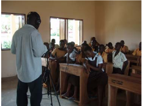
FgD with young people