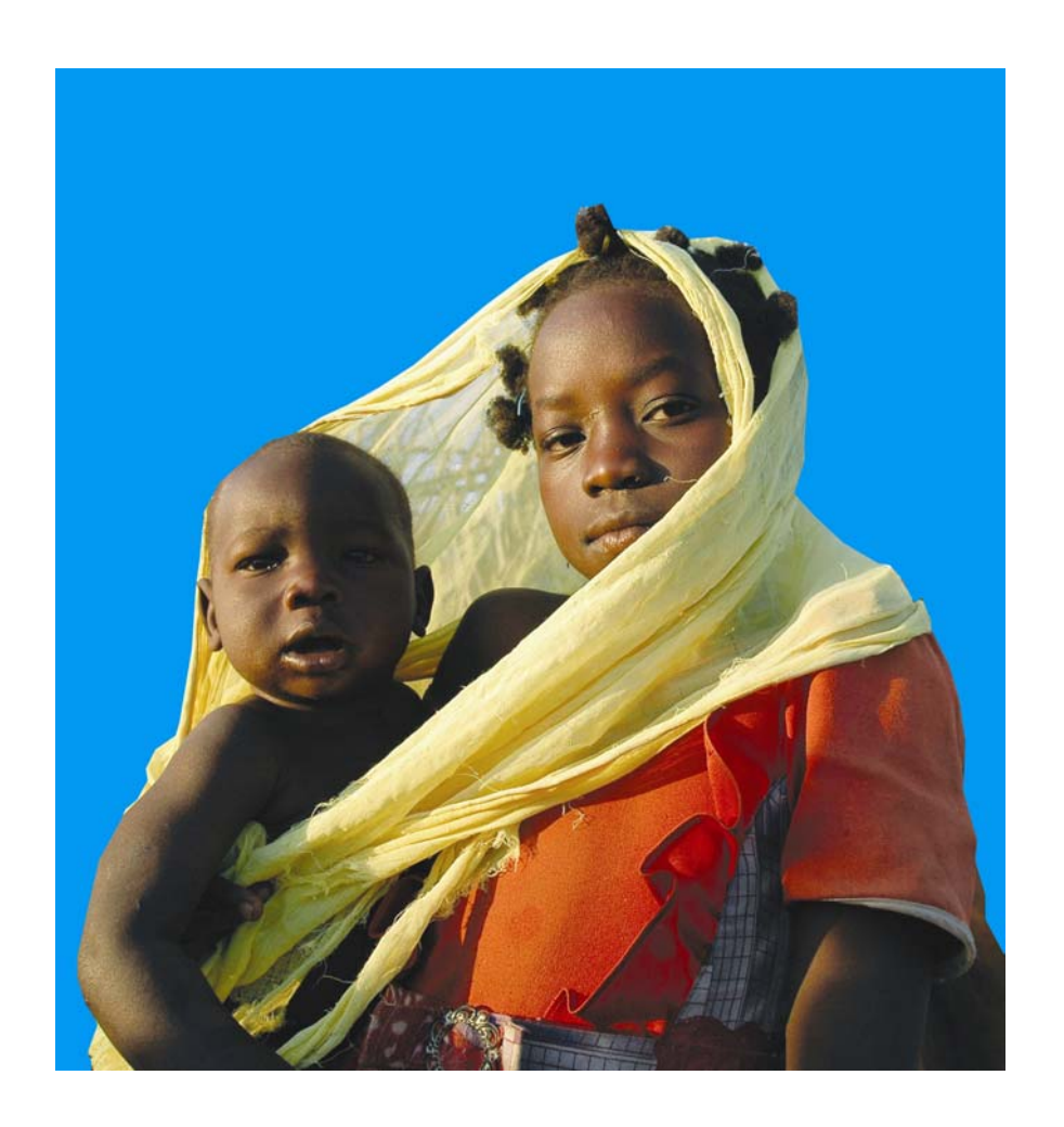
Situational Analysis Report: Conversations with the Community