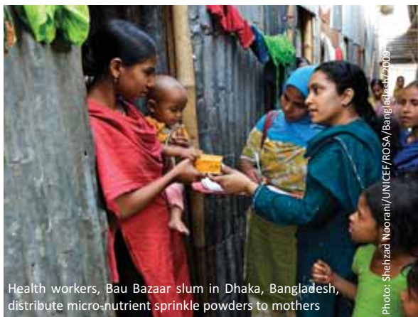
Health workers, Bau Bazaar slum in Dhaka, Bangladesh, distribute micro-nutrient sprinkle powders to mothers