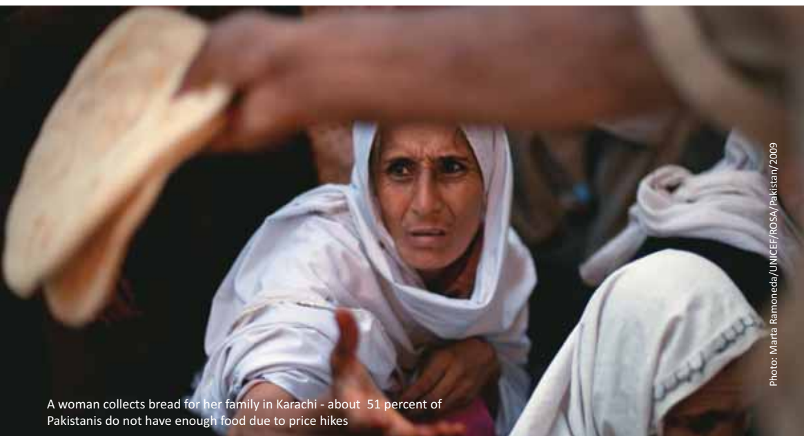
A woman collects bread for her family in Karachi - about 51 percent of Pakistanis do not have enough food due to price hikes