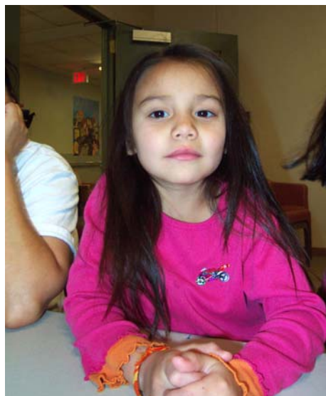
Prior to the opening of Hutto, detained children were separated from their parents and placed in the custody of the ORR Division for Unaccompanied Children’s Services.

Congress discovered this and took immediate action to rectify