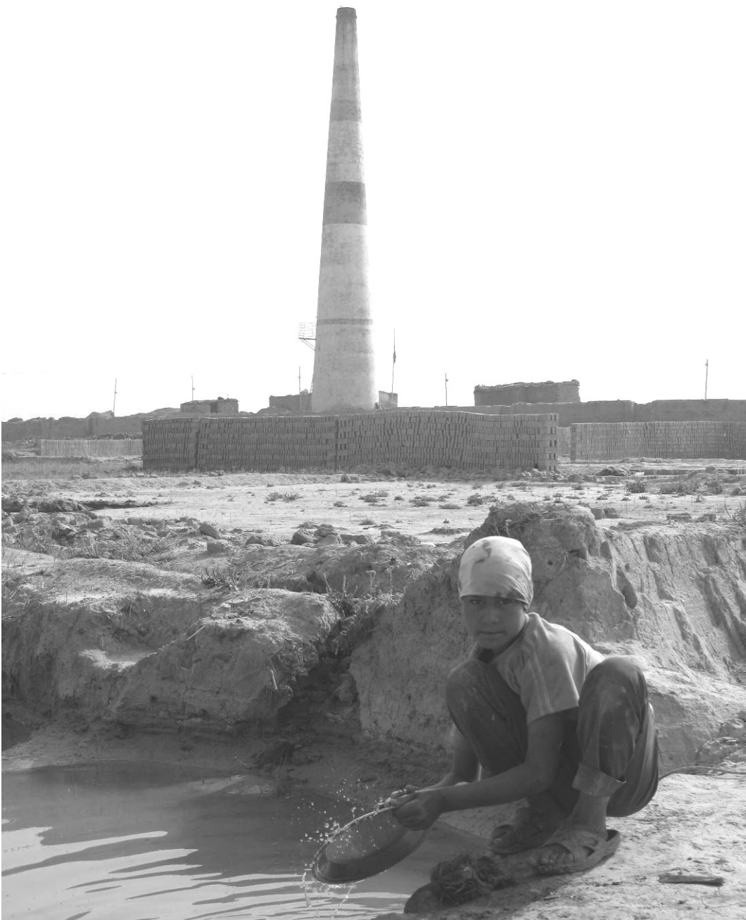
Young brick kiln worker in Kathmandu