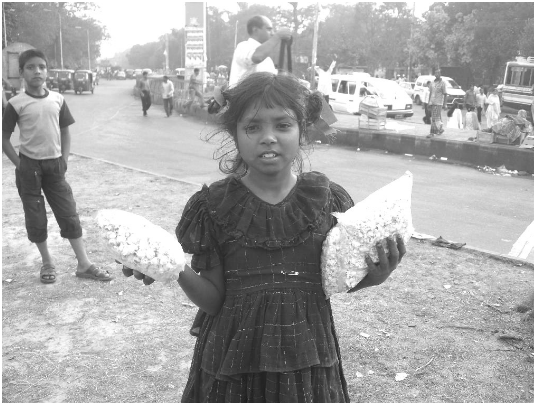
Young girl selling popcorn to passengers in passing cars

Girls who are found working out in the public domain only do so because of extreme poverty, which makes most social norms redundant. Sending daughters to work outside the home is usually something parents only do when they have no other options; patriarchal institutions and purdah simply crumble. Household poverty is most present in migrant families, female-headed households and families with a high number of children in one family, especially a high number of girls. It is often the lack of an older son that makes a poor family decide to send a girl to work [White 1992: 36]. For orphan girls who live without relatives at all, working in the streets goes hand in hand with living on the streets. The girls on the street rarely attend school.