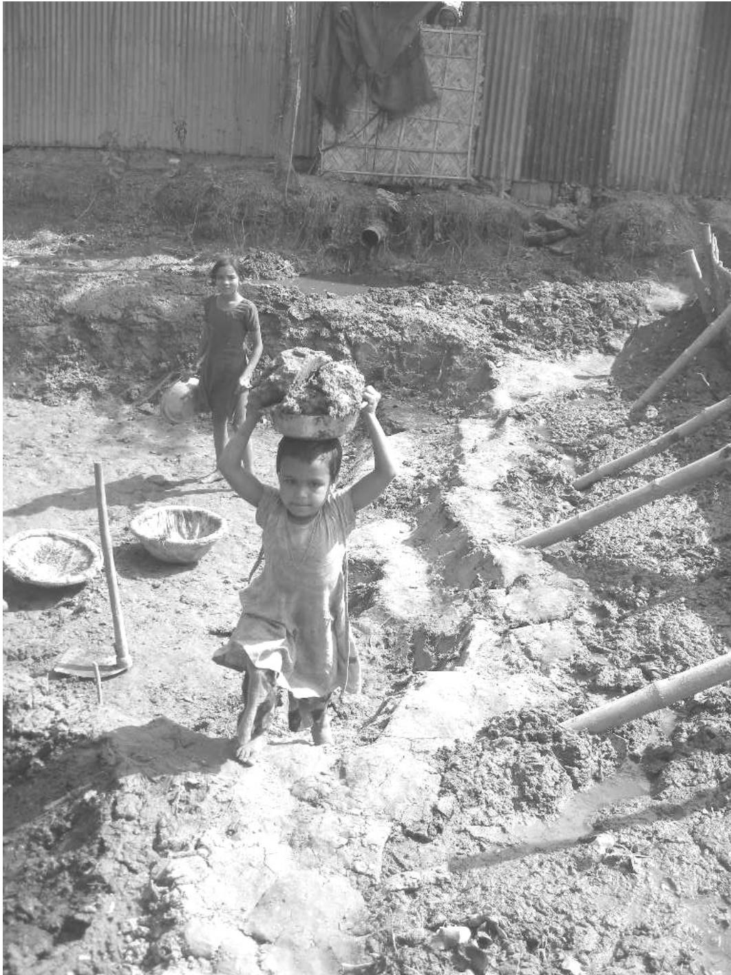
Young girl in Dhaka helps to collect mud and carry it home