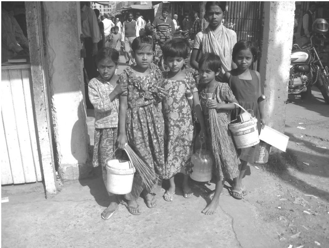
Girls collecting rice from the market floor

It may not be possible to prevent all work at home by underage children, given the dramatic levels of poverty, but specific dangerous activities, such as incense stick making, should be banned from home-based industries. The provision of better infrastructure in the neighbourhood, e.g. water taps with running water or child care facilities, would already go a long way to decrease their overall workload (which always includes household chores).