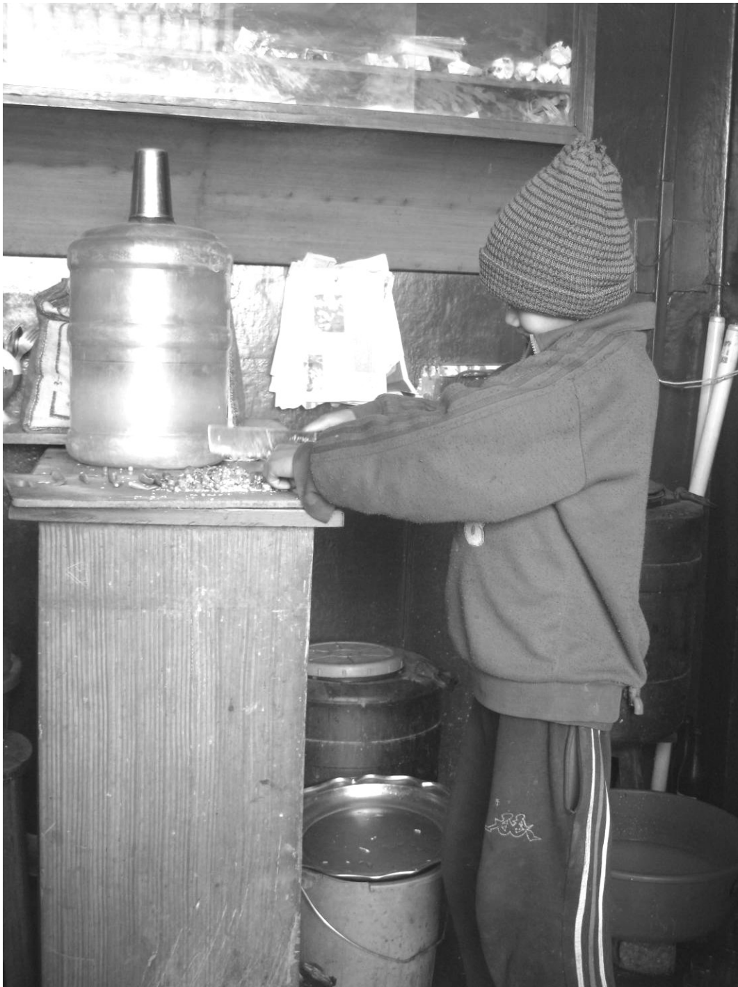
Young restaurant worker in Kathmandu - Here he is seen chopping vegetables