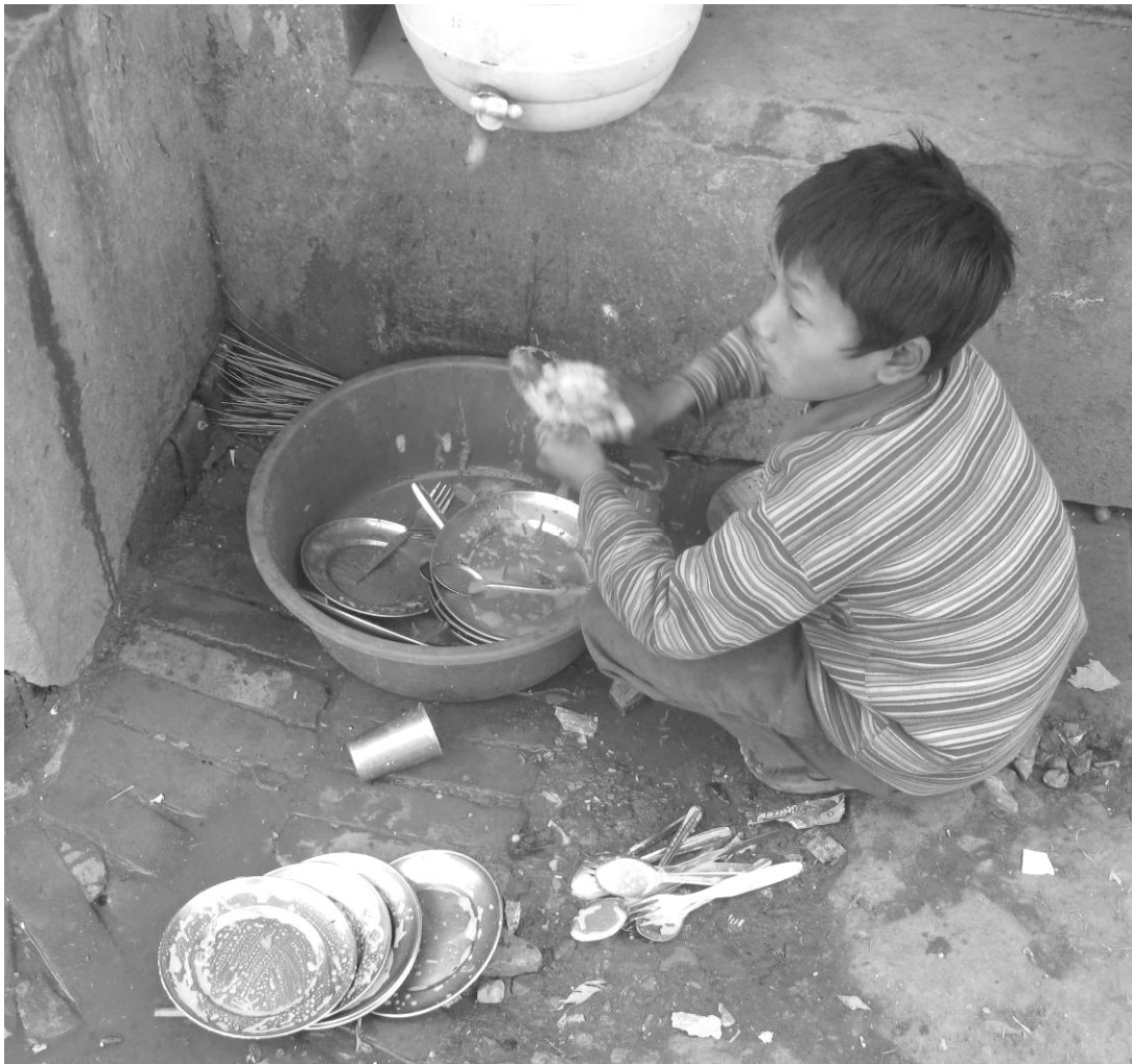
A young restaurant worker - here he is washing dishes and cutlery

himself originating from a remote area, has usually recruited a child worker from his village by making arrangement with his parents, at other larger eateries, children have found the working place through their social network of friends who were already working at the same eatery or in the same area. Jobs in sweetshops and local restaurants are easily available, as they employ a lot of staff, which do not tend to stay in one place for a very long time. Especially in the small eateries around the bus station children tend to change workplace relatively quickly, and working at one place for only a week is common.