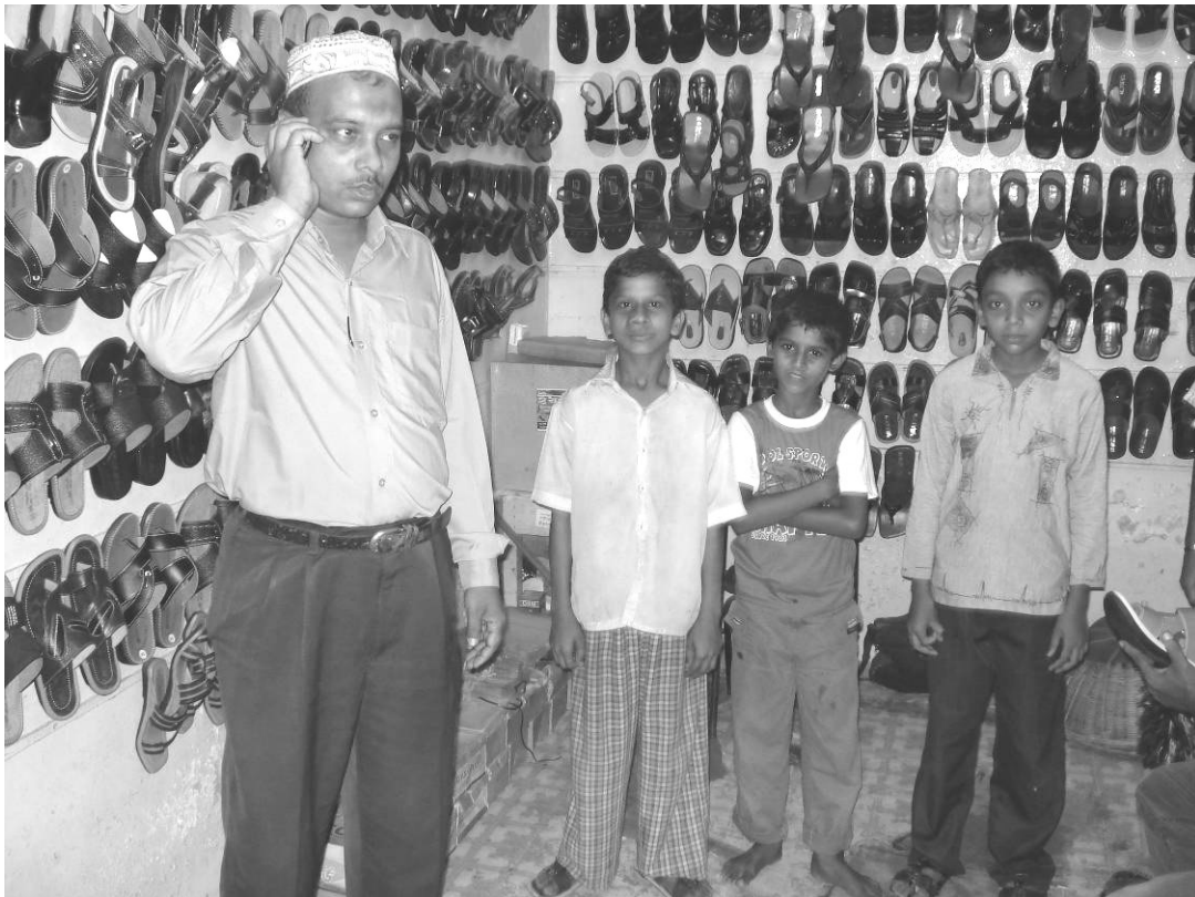
Young assistants in a shoe shop

The boys who work in shoe shops start just before the shops open, around 10 in the morning, and stop working just after 8 in the evening, when shops close. Most shops are closed on Fridays, which is the workers' day off. The boys are not exposed to very dangerous conditions or heavy physical activities. The worst aspects of being an assistant salesman are the long working hours and the fact that this job cannot be combined with education. The salary of a child shop assistant ranges between 1000 and 2200 taka per month, depending on age and experience. A period of "apprenticeship" is common. Especially the boys who live in their employer's house don't earn a salary at the beginning.