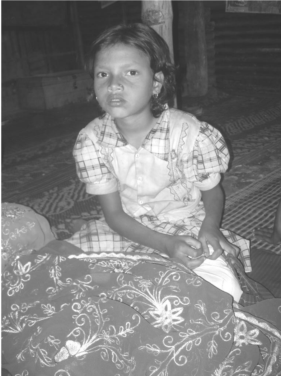
A young girls shows the sari she has produced at home