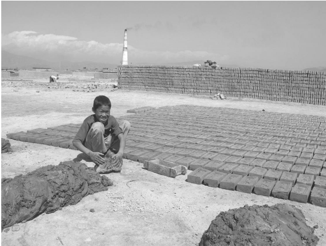
Young boy working at the brick kiln

brick kiln purposefully to work, as they are not able to stay behind in the village, as well as children who came to assist the family by making bricks, or taking care of the household chores. Depending on the amount of work they are required to do, and the viewpoints of the parents, some of these children are able to attend school, if available near the brick kiln, while others are not.