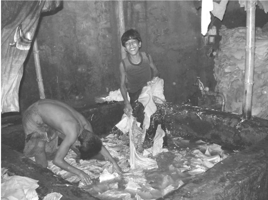
Young tannery workers rinsing chemicals from hides and soaking them in preparation for shaving

Working days in a tannery can last up to 14 hours. Although there is officially one free day, the children often work 7 days a week. Work in a tannery is always a fulltime job and most children have little time to play, or to travel to their parents in the villages. Especially children who migrated to Dhaka on their own, lack a personal network of people around them.