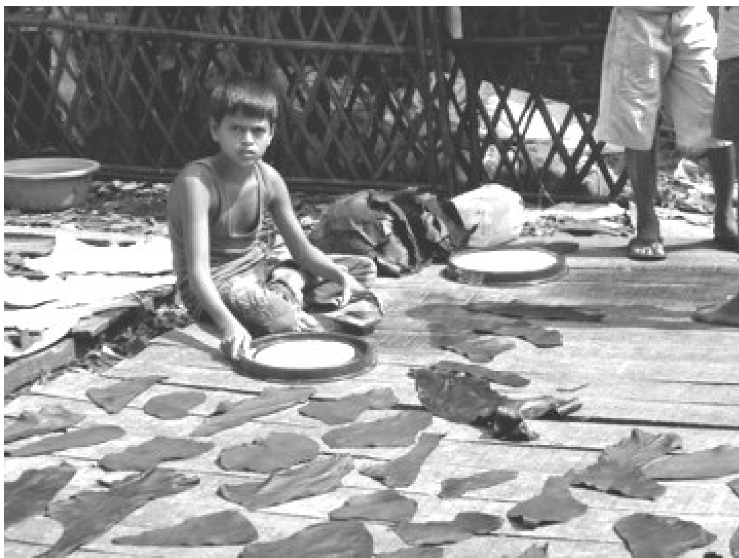
A young boy in a Dhaka tannery - Here he is seen sponging pieces of leather with dyes and other chemicals.