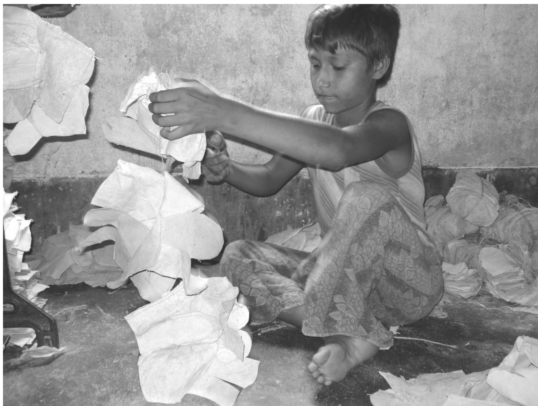
Young boy cutting leather for gloves

The children who manufacture gloves at home work in the relatively best conditions. They work fewer hours, their work can be combined with school, and they usually work with their parents or other familiar persons. It is normally the mother who is officially employed as a manufacturer; the children help but don't get paid.