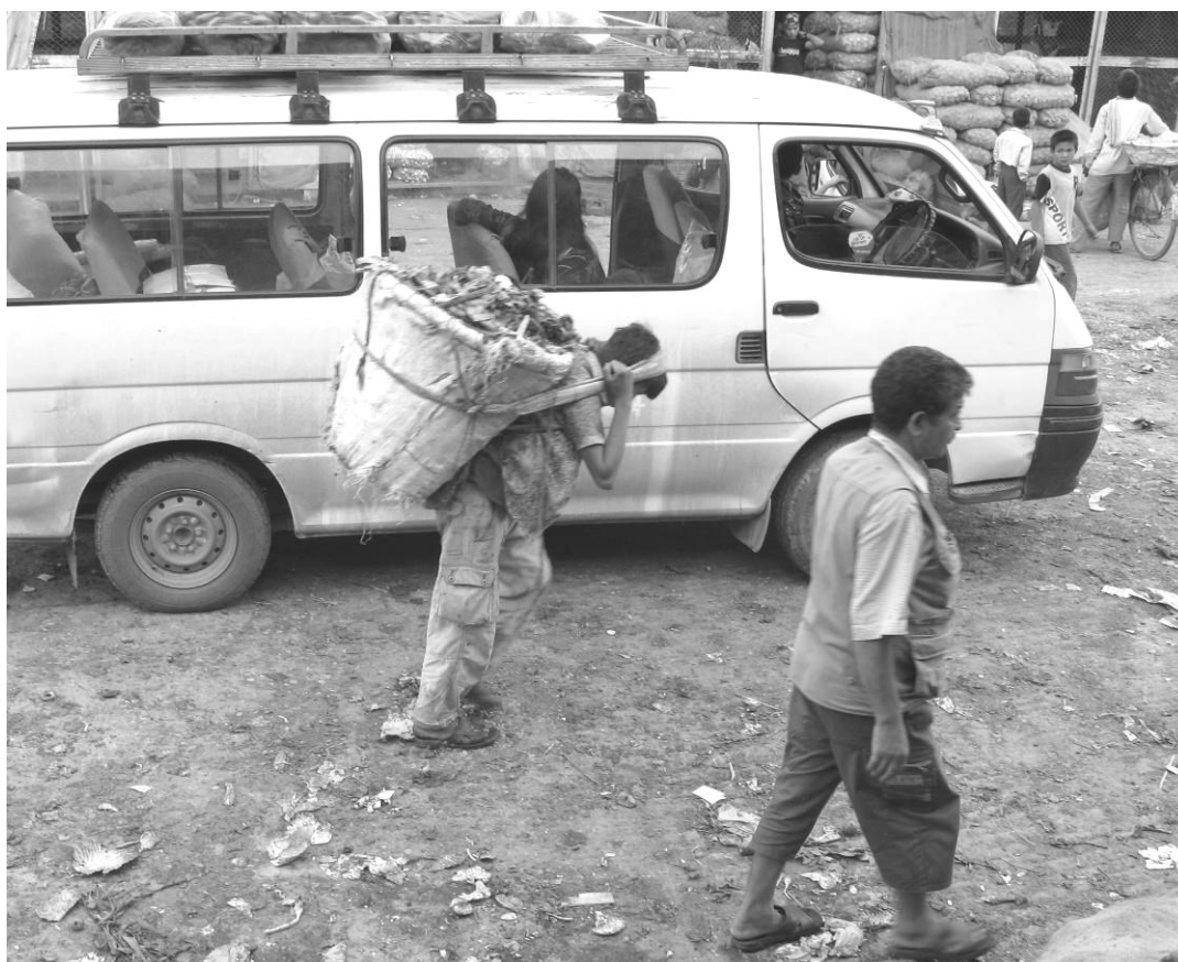
Young porter carrying a heavy load - suspended from a strap tied across his forehead

on the market or in a small rented room the Kalimati area, and to a great extent have control over their earnings. But despite certain positive aspects that children mentioned about the work as porters, including its availability and flexibility due to the absence of owners and/or employers, living and working conditions of porters are extremely dismal. They have to carry heavy loads in a congested, dusty and heavily polluted environment, in which they are exposed to a number of health risks. They often walk barefoot, and have no more than a piece of jute rope to carry their loads, suspended from their foreheads. Some also use a back cushion to give some support. Carrying such loads, which are sometimes even heavier than their own body-weight, can lead to physical problems, and children reported painful legs, back pains and regular headaches. However, especially the younger porters did not seem to take into account the long-term consequences of their regular physical pains. In addition, children are exposed to the habit of smoking cigarettes, and, to a lesser extent, the use of alcohol and drugs.