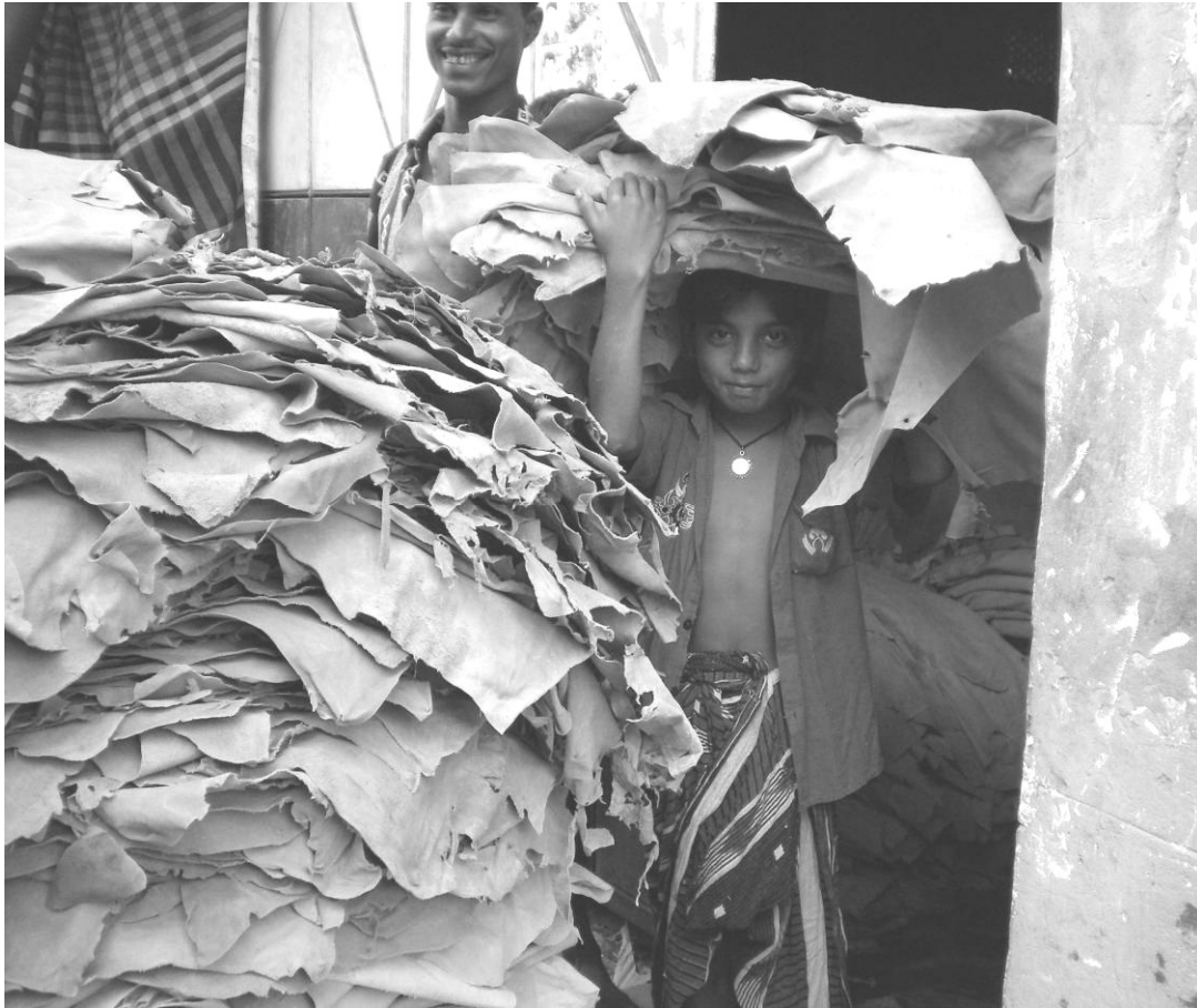
Young tannery worker carrying skins on his head

During the production process the leather is transported a number of times. The internal transportation of the wet leather is mainly done by adults because of the weight and slippery character of the wet hides and skins. Sometimes children are involved in the lifting and carrying of hides over small distances (meters). The skins are placed on the head and then thrown to the ground or on to a cart.