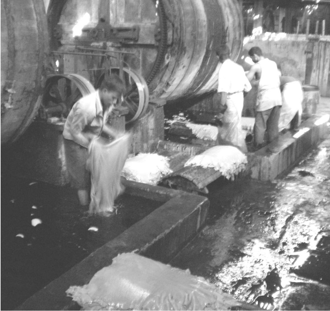
Tannery work site - It is clear to see how wet the floors are, and how the boys unloading the drums stand up to their knees in water and chemicals.