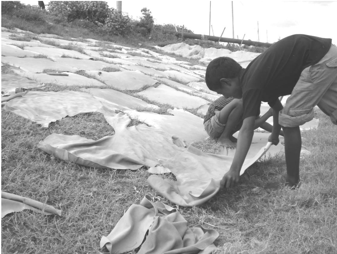
Boys toggling - squatting and stooping for many hours each day

Children involved in toggling, work outside and are much less affected by chemicals. The harsh aspects of this work are mostly related to weather conditions and the stooped position they must hold during work. They work with sharp pegs and hammers, without any gloves or protective footwear, and so many accidents involve injuries to hands and feet. The children who toggle are paid per unit: 20 or 30 taka per 100 dried pieces of leather. Working hours are not fixed and depend on the workload. A daily income is approximately 100 taka (ca. 1 euro) for a full working day.