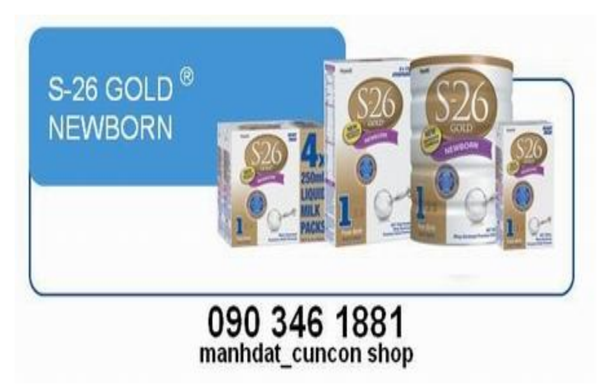
An online shop ads for hand imported milk