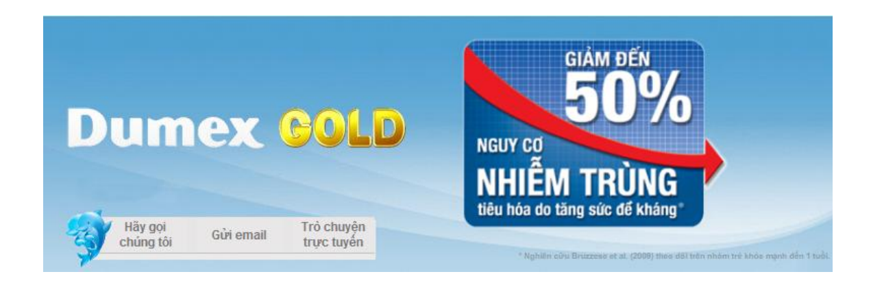
Dumex – Decrease 50% risk of digestive infection