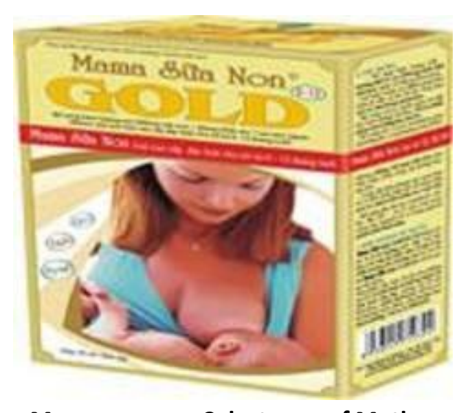
Mama sua non: Colostrums of Mother