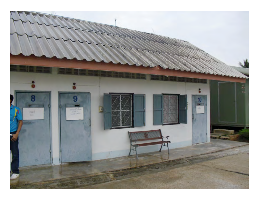
Outside Detention Room