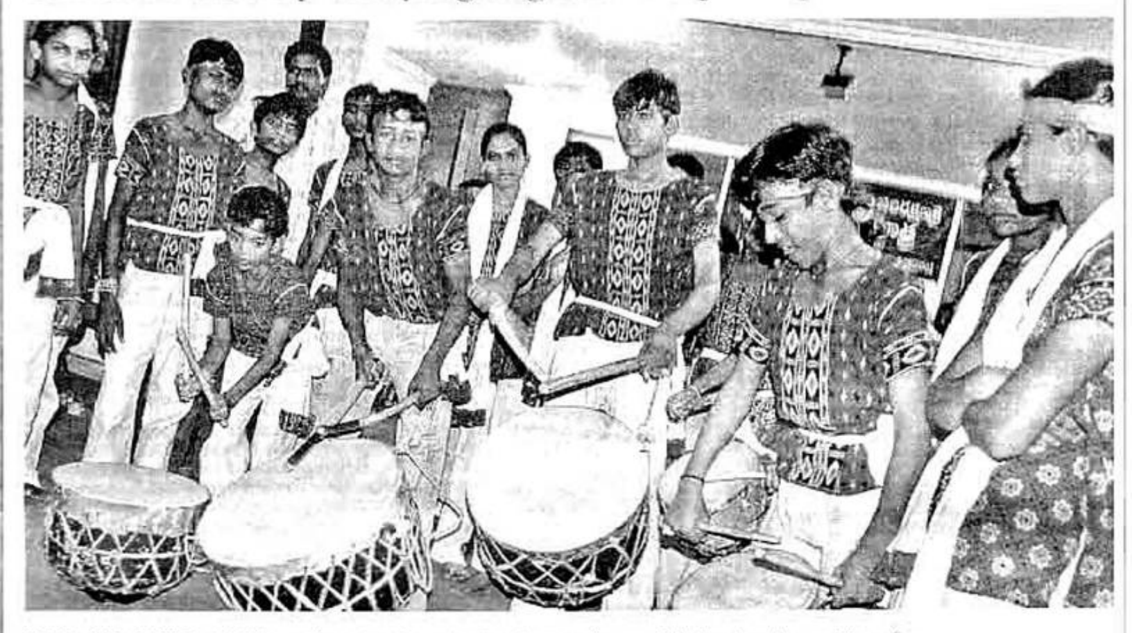
LOUD AND CLEAR: Children from Prakasam district staging a skit in the city on Tuesday.

Children take up campaign against corporal punishment