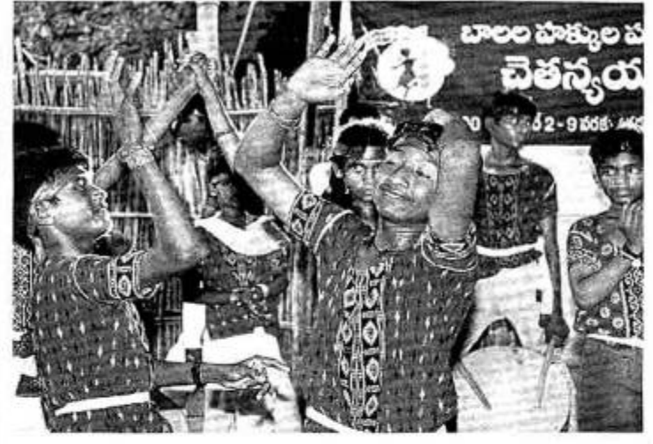
FOR A CAUSE: Child artistes perform a street show in defence of child rights at Eluru on Sunday.

Their show with the theme woven around the boating of children at home by parents under the influence of alcohol, at workplace by employers, by teachers at school and child trafficking, made the digoitaries at the programme, who included police officers, the Assistant Commissioner of Labour, and Fr.