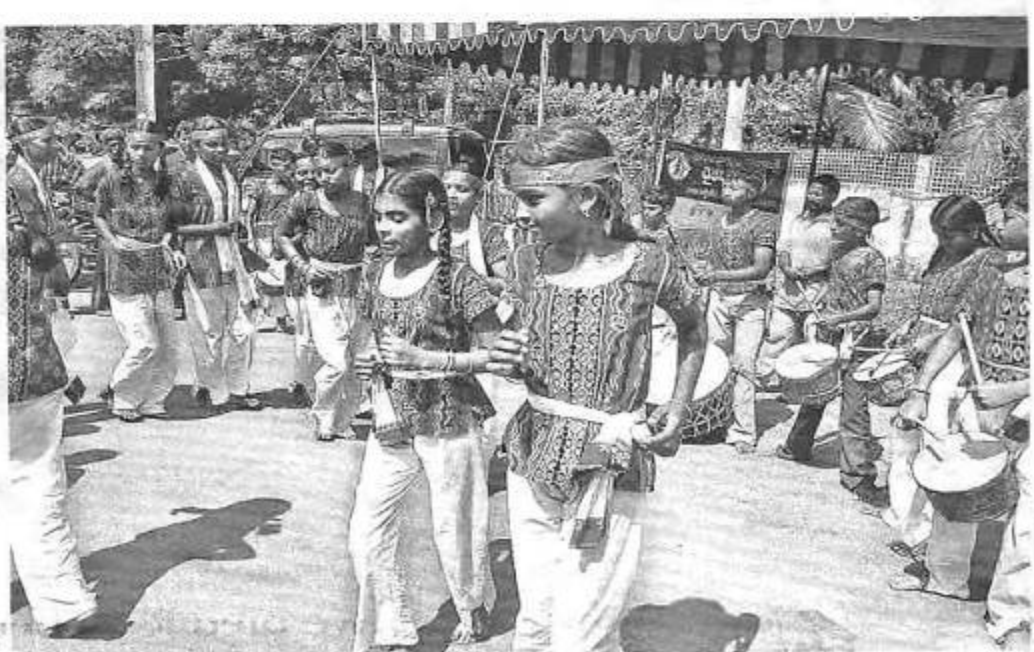
FOR A CAUSE: Campaign against Child Labour troupe performing their skills near Y. Junction in Rajahmundry on Monday, - PHOTO: S. RAMBABU

According to UNICEF survey sexual harassment , against 18 and 14 years of girls in our state is 41 per cent which is in 5th place and age group between 15 and 18 is 35 52 per cent (8th) place.