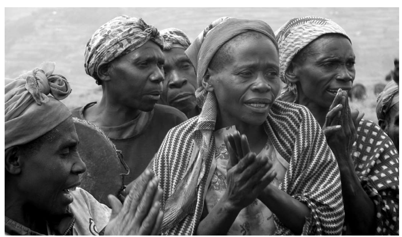
BATWA WOMEN IN UGANDA.

MRG has worked with Batwa non-governmental organization (NGO) partners to establish areas of particular importance, and highlight the need for more comprehensive official data to help inform outreach programmes and policies. The unique investigations conducted in four countries, albeit on a small scale, identify and analyse some of the problems Batwa women and girls encounter, as conveyed by Batwa communities themselves. In particular, they focus on lack of access to education and worrying proportions of gender-based violence.