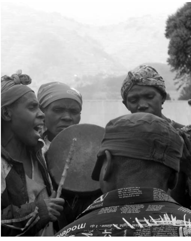
BATWA WOMEN SINGING.

The attitude of Batwa parents in the DRC to education of girls is closely tied up with attitudes towards marriage and the role of girls in society. One parent said, 'Women were created to be married, have children and to look for food and not to spend time in front of men studying.' Another parent's response was, 'According to the Pygmies, a girl who goes to school and reaches secondary level is considered a free woman, i.e. a whore, because she might not get a husband within the community.' The responses of other parents and teachers indicate that the financial implications of marriage, i.e. a dowry given to the girl's family, encourage early marriages and discourage education. According to one parent, 'Pygmy parents don't expect to live long so their daughters must get married quickly for fear of being abandoned by the young men in the villages but also so as to use up the dowry before they die.' Another parent said, 'The more a girl studies, the less chance she has of getting married,' and a teacher's view was, 'Women encourage their daughters to get married quickly so that they can get a few goats to eat as a dowry.'