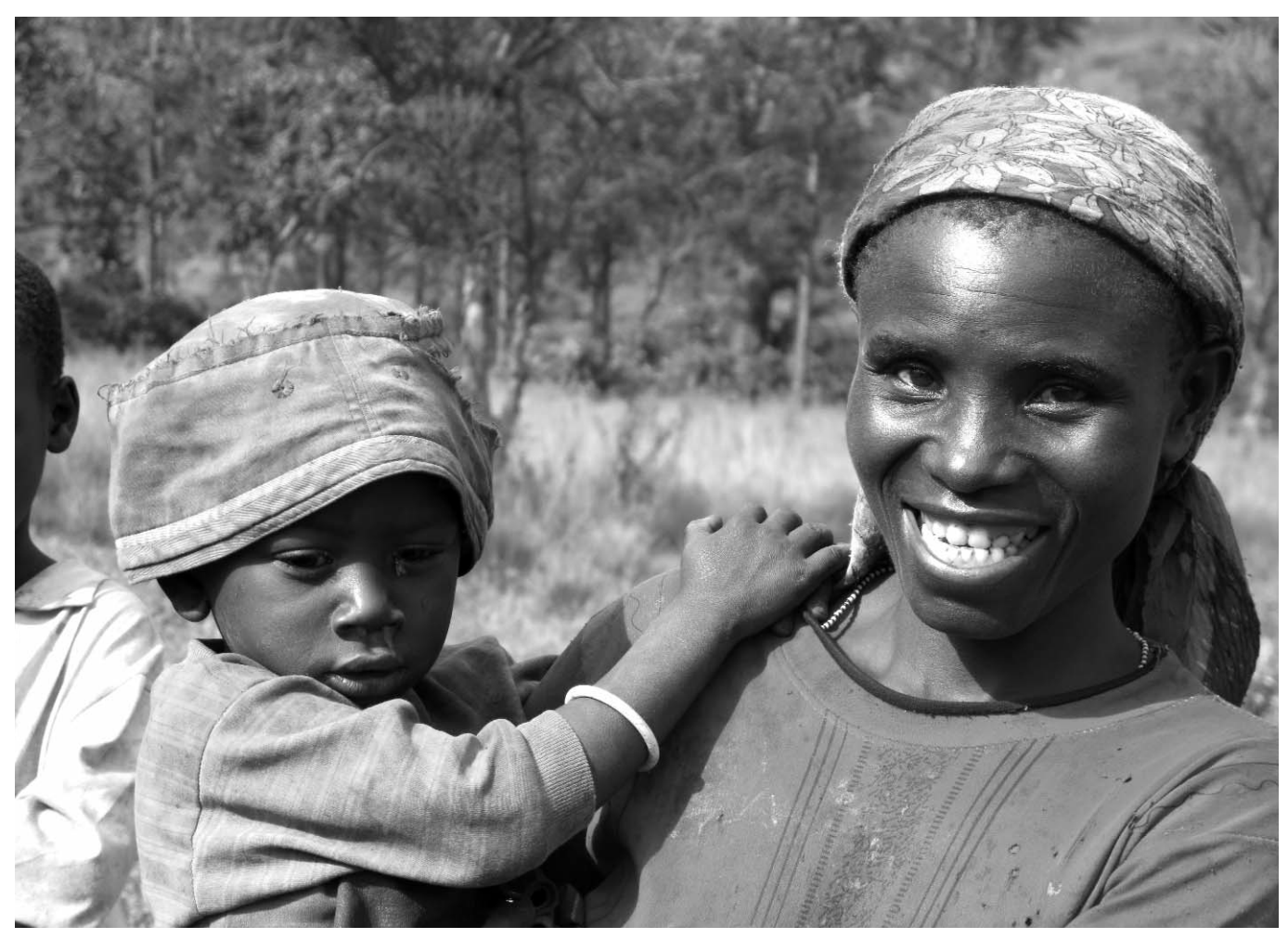
BATWA WOMAN AND CHILD IN BURUNDI.

It is clear from the results of the research in all four countries that Batwa women and girls are marginalized