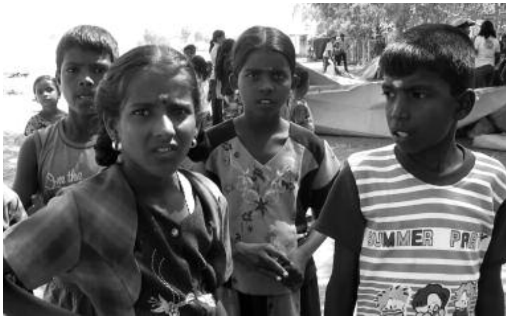
Left: Tamil children in IDP camp, eastern Sri Lanka