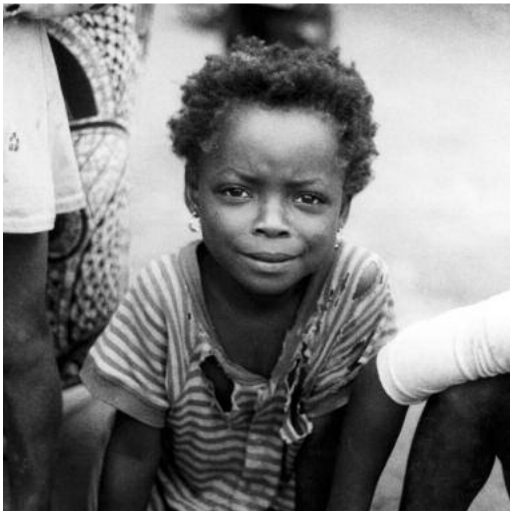
Left: Indigenous girl from a community affected by commercial logging, Province Orientale, Democratic Republic of Congo.

that villagers in the increasingly militarized Chin state were being forced to take part in pro-government rallies, or face heavy fines, leading some to flee to neighbouring India.