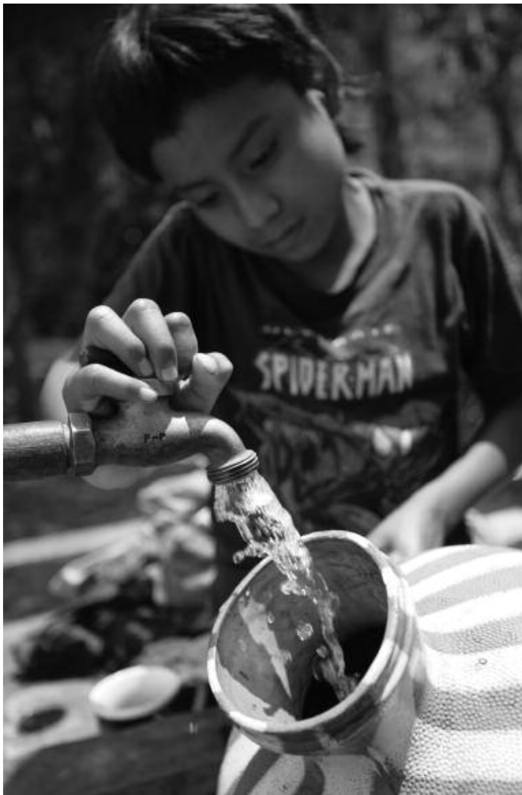
Left: A boy collecting water in the Maya Chorti (Ch'orti) indigenous community of Nueva San Isidro, Honduras.

Unlike efforts in neighbouring countries, the Afro-Peruvian presence is still not adequately addressed by the country's statistical instruments, which means that Afro-Peruvian communities remain officially invisible as well as deprived.