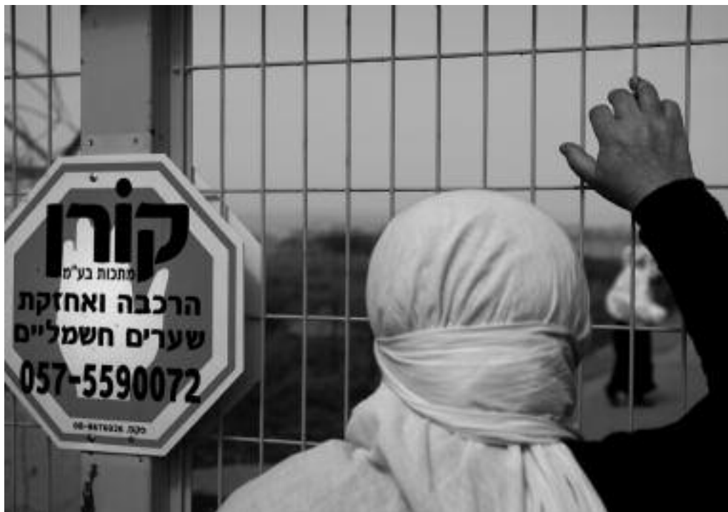
Left: A Druze woman in the Golan Heights watches from a UN zone crossing along the Israeli-Syrian border.

services, they cannot live in the desert.' Indeed, 120,000 Bedouins have moved into seven approved government towns. However these cramped settlements, with scant attached land, suffer shoddy design and were erected beginning in 1968 without Bedouin input. Forced urbanization has led to a loss of Bedouin traditional customs, high crime rates, drug problems and severe unemployment. Bedouin women have been especially affected, having lost their traditional social roles; added hurdles to mobility outside the home have contributed to near 90 per cent unemployment for women. In mid-July the government announced the establishment of a new agency to handle Bedouin issues.