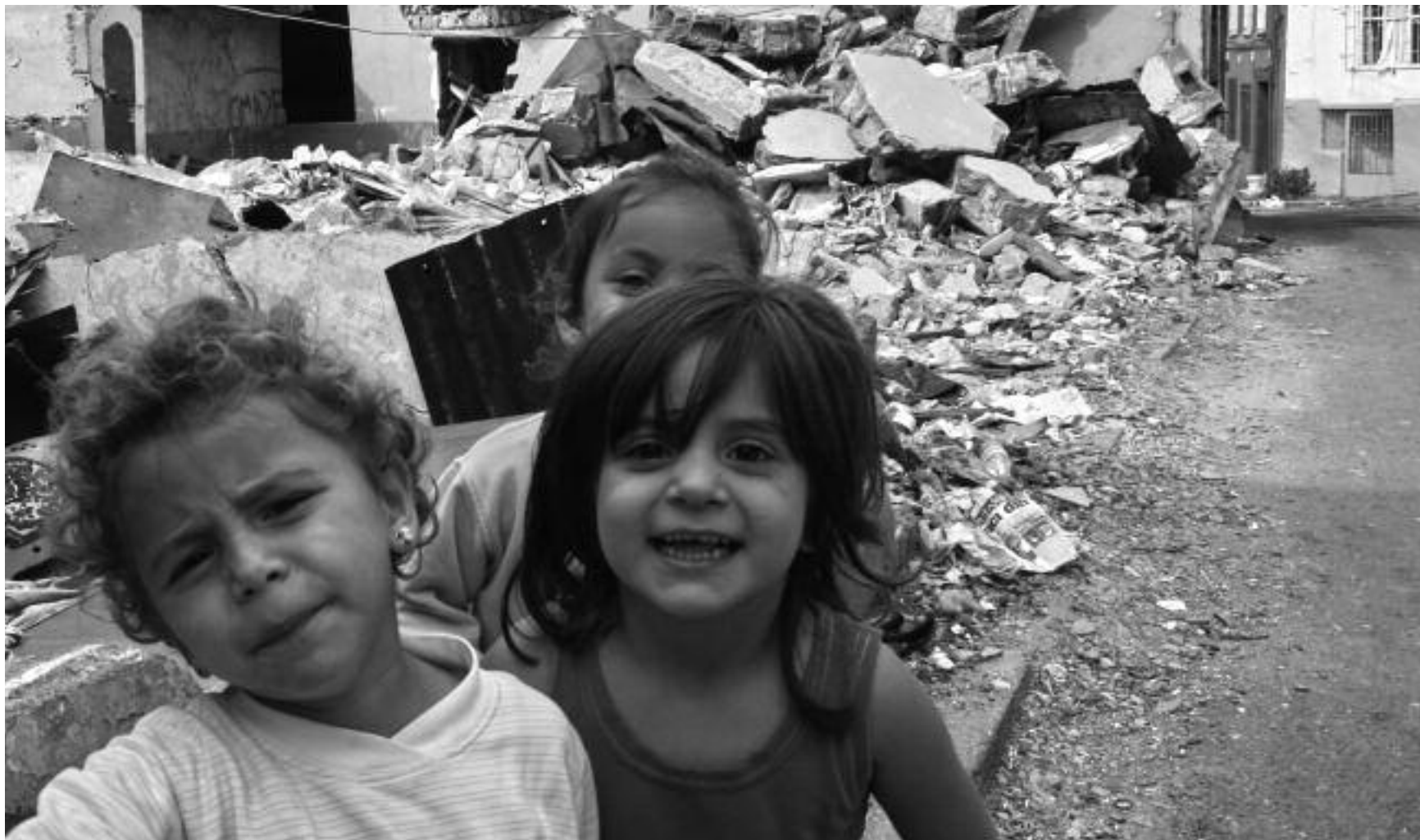
Left: Children in the Roma neighbourhood of Sulukule, Turkey. The area has started to be demolished due to 'urgent' urban transformation proposals developed by the Fatih and Greater Istanbul municipalities.

was leaked to the press but never published, called for a far-reaching overhaul of the country's constitution and statutes in order to achieve international standards. According to Agence France Presse, it described as 'paranoia' the notion that rights for Kurds and other groups would lead to the break-up of the state. Charges of sedition against Oran and Kaboglu were dismissed on free speech grounds by a court in 2006 but reinstated by an appellate court in September 2007.