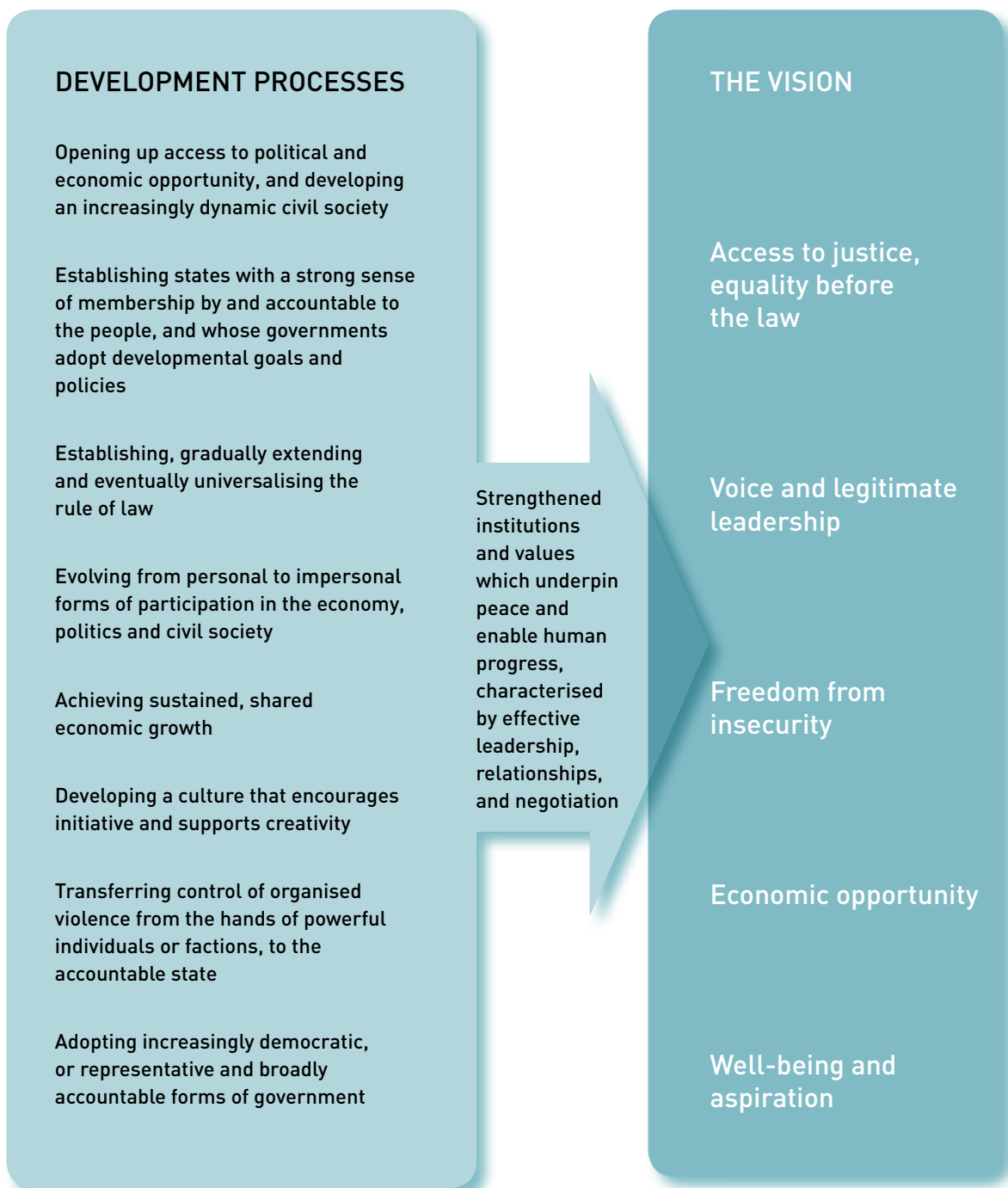
Figure 2: A model of human progress

The path of progress towards a vision in which people are able to resolve their differences without violence, while continuing to make equitable social and economic progress, and without lessening the opportunities for their neighbours or future generations to do the same. Key processes which contribute to and build on the institutions and values which enable development are shown on the left of this model; these lead eventually towards the vision of progress represented by the factors on the right of the diagram. While the vision provides a guide, it is elements such as those on the left that need to be led, catalysed or supported by those seeking to promote human progress.