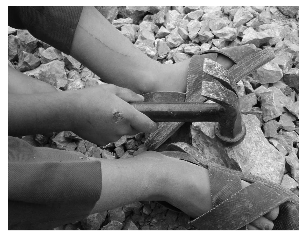
The young children who produce gravel do so without protective equipment. They all have the telltale wounds on their hands and feet. Many also have eye injuries from rock shards.