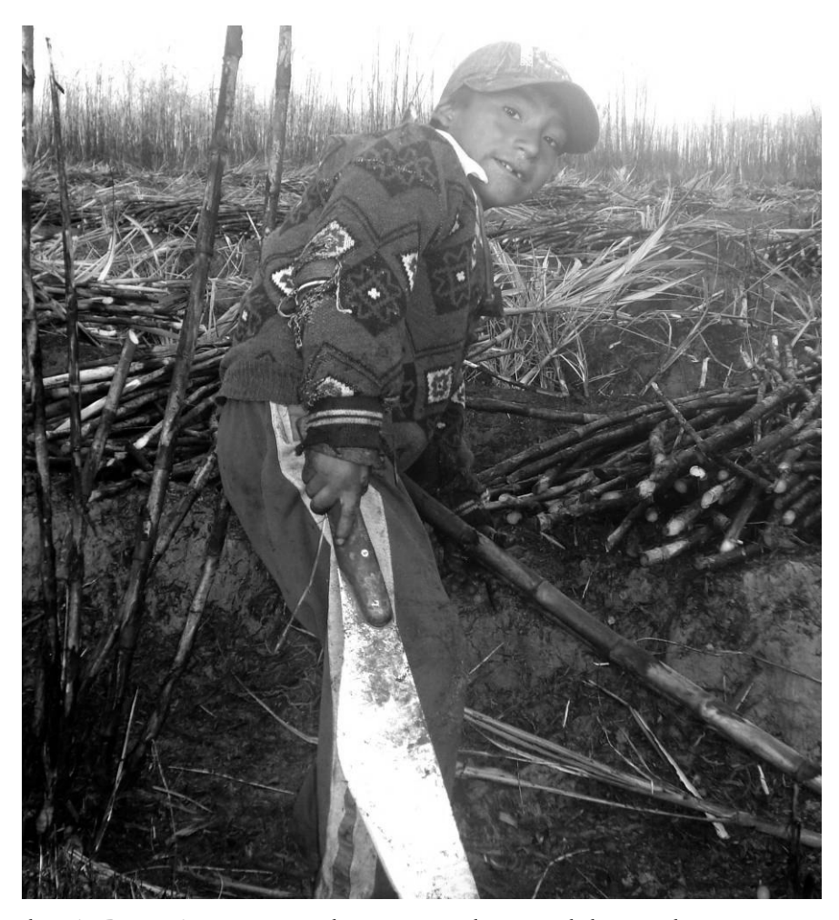
A young boy in Bermejo uses a machete to cut down and de-top the sugar cane stalks.

Both in Santa Cruz and Bermejo, adolescent boys from the age of 14 and up work as contracted harvesters, and are involved in all activities. First they set the crops alight; this removes all unwanted foliage from the cane. Then the cane is chopped down with a machete. Subsequently, the cane is de-topped, stacked and loaded onto the flatbed for transportation. In Bermejo harvesters work according to the cuarta system; in this system a contracted harvester brings a helper along who earns about a quarter of his salary. These cuartas are adolescent boys and girls or the wives of the harvesters.