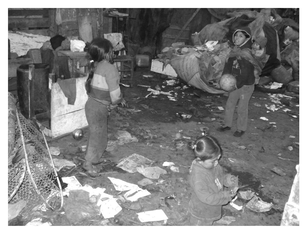
Children live and play on the same site of their parents' waste recycling business.