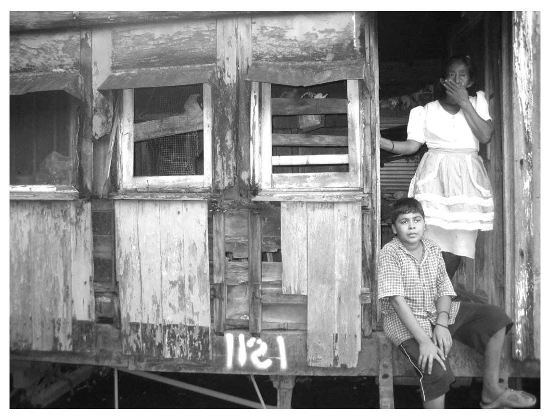
A mother and her fourteen-year-old son in Brillantes. You see them here in their home, an old abandoned train wagon; the living conditions of the quarrying families lack all basic facilities.

Although Pomarrosal and Brillantes both have a primary school, there is a shortage of learning materials and teachers in Pomarrosal, which results in poor educational quality. Among quarrying children in general there is a high level of school dropout, especially by girls. The majority of children do not enrol in secondary education due to economic reasons. In Brillantes, where there is a secondary school, parents may withdraw their children from school because the purpose and value of education has never been directly experienced by them. Despite the fact that both communities have a health post, the offered services are extremely basic and, in Brillantes, medicine is not free.