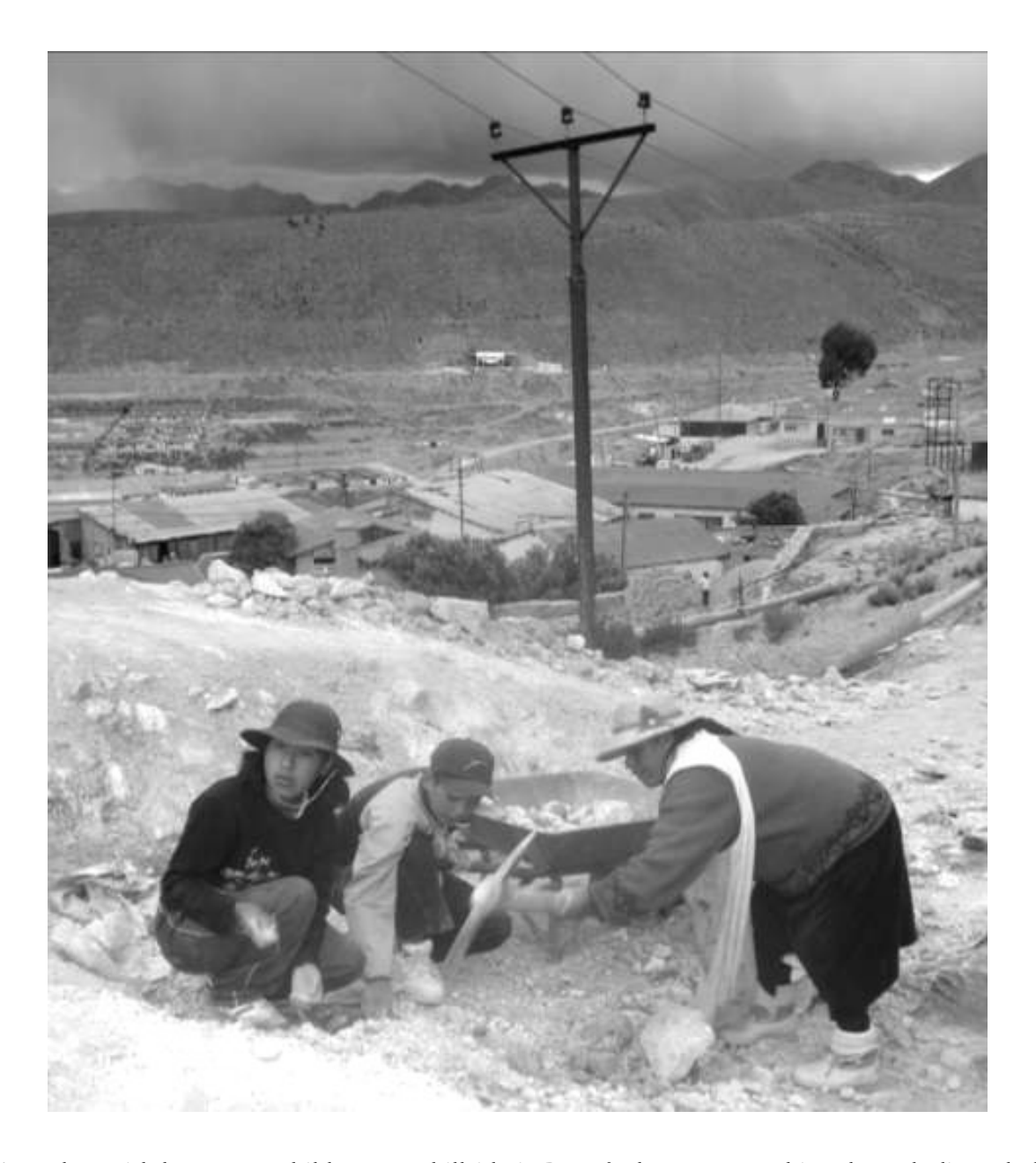
A mother with her young children on a hillside in Potosí; they are searching through discarded materials in the hope of finding usable ore.