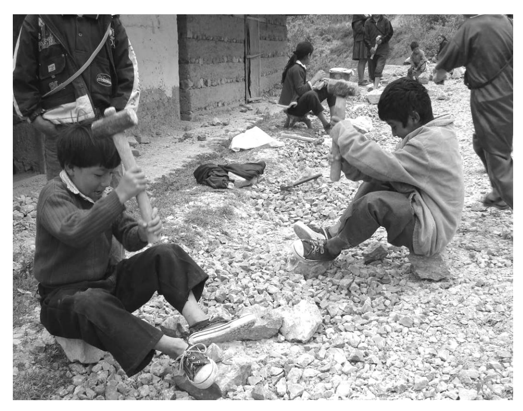
A group of young boys and girls producing gravel, near Chota.