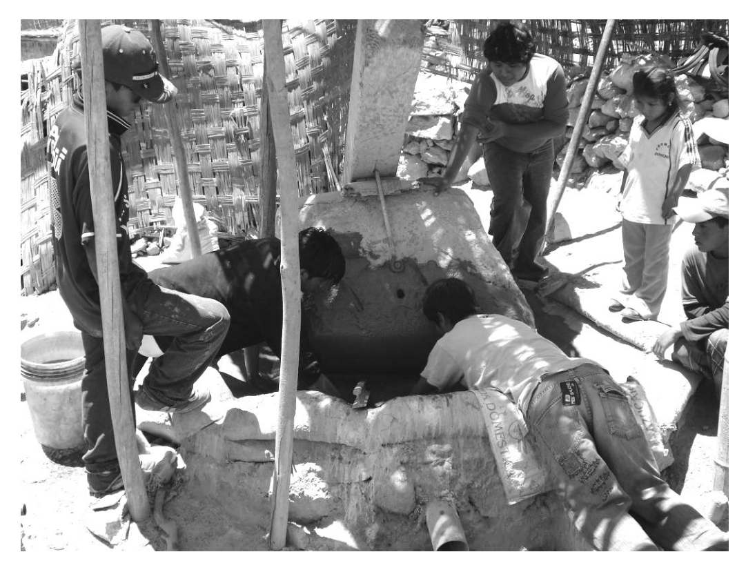
Young boys in Santa Filomena processing the ore; above they are using the quimbalete to grind the ore; below they are combining the ore with mercury to isolate the gold, without the use of protective clothing.