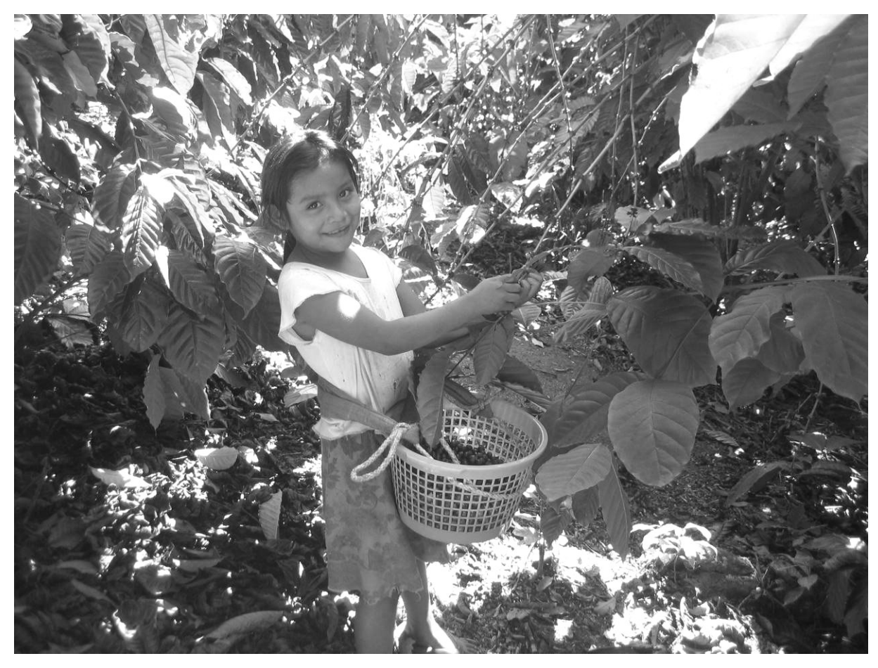
Nine-year-old girl picking coffee berries on the El Amanecer coffee plantation. She attends school irregularly; during harvest time she often skips school to help her family.