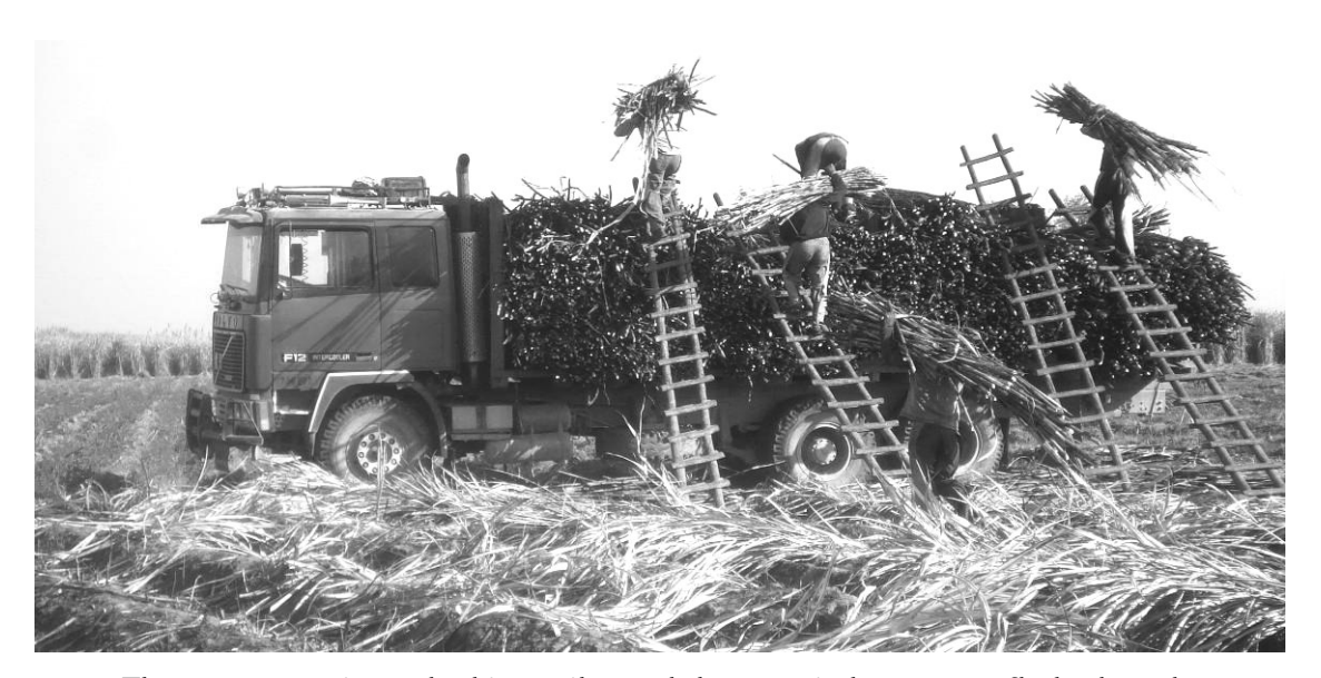
The sugar cane is stacked into piles and then carried up onto a flatbed truck.

A pensionista gets money from a group of harvesters to cook breakfast, lunch and dinner. Girls of 14 and older are hired to do this work, both in Santa Cruz and in Bermejo.