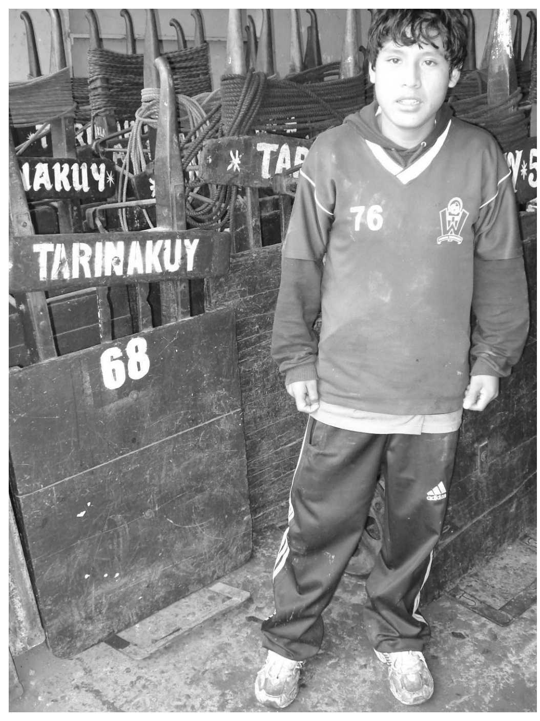
Fifteen-year-old boy working as a porter at the fruit market in Lima; he is a member of the Warma Tarinakuy young porter's association.