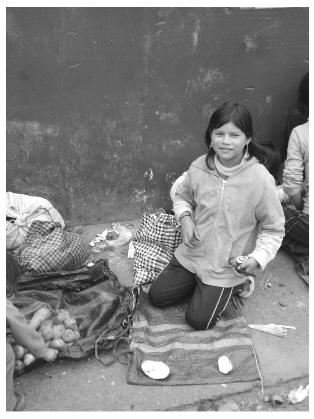
Ten-year-old girl selling potatoes at the vegetable market in Lima, Peru