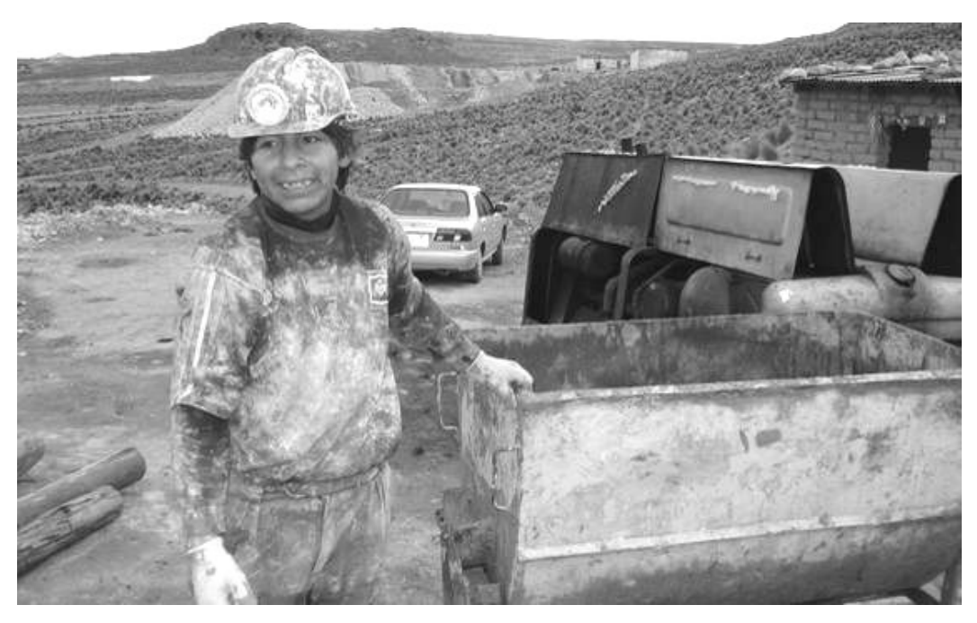
A young boy outside the mine; here he is seen with a carro , the metal wagons used to transport ore and other materials out of the mines.

In Potosí, adolescent as well as adult miners claim to be satisfied with their income, which they say is reasonably high because of the metal prices over the last couple of years. They earn between 50 and 100 Bolivianos a day (5-10 euros). This can add up to 1.000-3.000 Bolivianos per month (100-300 euros)<sup>12</sup>. In Llallagua, prices for the metals are the same as in Potosí, but there is less metal to be found in the shafts. Miners here complain that they earn little money, or sometimes nothing at all.