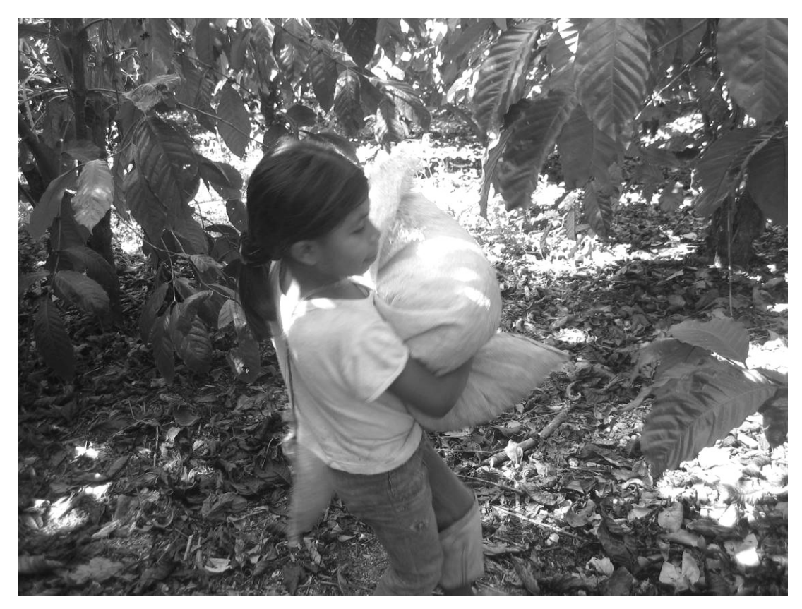
Carrying heavy loads is just one of the many tasks on the coffee plantations that children participate in. Here you see a ten-year-old girl carrying the berries they have just collected.

Activities that prevent the achievement of compulsory education are also considered worst forms. The harvest season overlaps with the school cycle, and thus has negative effects on the intellectual development of children. This is especially true for the children of migrant families. In Chipel this applies to about 10% of the children. However, children on the plantations and in the small grower's community may also work throughout the school year, which can lead to school absence and exhaustion, negatively influencing school performance. In highland communities families interrupt their daily lives by leaving home and migrating to the coffee plantations; other families are separated because some family members stay home while others migrate. These dynamics result in a complete disruption of normal family life and a child's education.