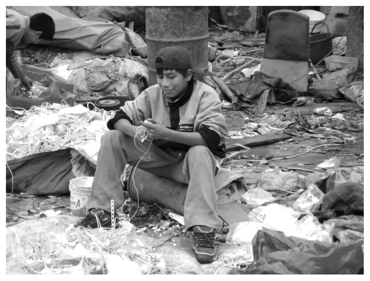
A fifteen-year-old boy sorts through clinical waste at a garbage dump in Las Lomas de Carabayllo; here he is seen with intravenous tubes.

In addition, working and living areas are closely entwined in both sectors; this increases exposure, and the chance of children working. In Carabayllo, children often work in the exact same place as they also live.