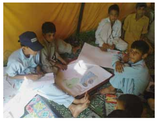
Internally displaced boys in a child-friendly space in a camp in Swabi District, KP. ( Photo: Mohammed Imtiaz Ahmed/SPARC, August 2009 )

Displaced children in Pakistan in 2009 – in host communities and camps – lost many months of education. Both girls' schools and boys' schools were attacked in conflict areas. In some areas of displacement, there was no access to education, and in other areas, that access was extremely limited. In camps, a strong effort was made to provide primary education, but this did not cover all students. Meanwhile, there was only limited access to secondary facilities in camp settings.