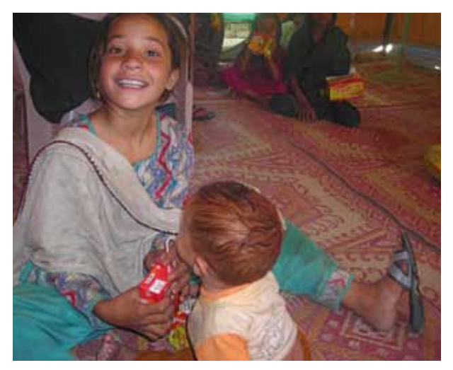
Internally displaced children receiving snacks at a camp in KP. ( October 2009)

Two organisations with active monitoring programmes were the IRC and the development NGO FIDA. The IRC has operated a protection monitoring programme in camps and also in host communities including some areas of Peshawar, Mardan, Charsadda, and Swabi. One protection team has worked specifically at distribution points, as many protection issues occurred there. Other teams have met with community leaders and elders to determine where IDPs were; next, the teams have attempted to visit the IDPs and conduct focus groups and follow up conversations in order to understand protection challenges in that particular area. They may have then gone on to form IDP committees (separate committees for men and women) and train those committees to conduct awareness-raising sessions and collect referrals. The committees have then referred extremely vulnerable IDPs back to the IRC monitoring teams.