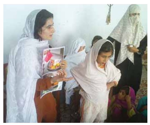
A session on nutrition and sanitation for internally displaced women and girls, in Swabi District of KP. ( Photo: Mohammed Imtiaz Ahmed/SPARC, August 2009 )

The Guiding Principles indicate that special attention should be paid to the health needs of women and girls, including access to female health care providers and services. ^{54}