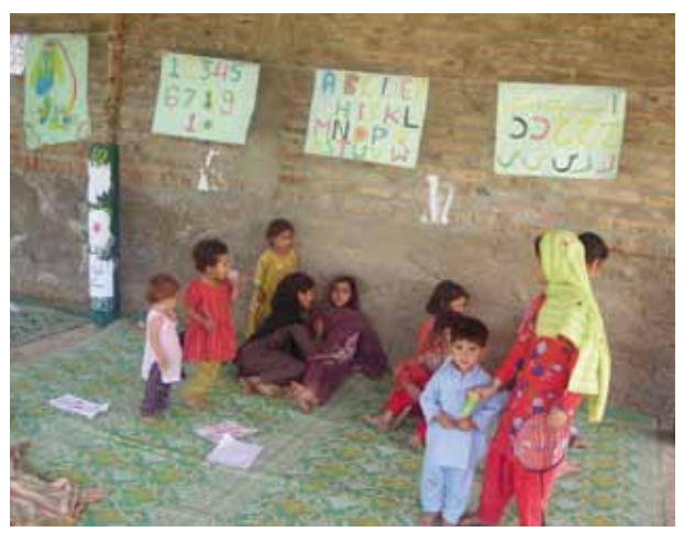
Internally displaced children at a child-friendly space in a host community in Khyber Pakhtunkhwa. (, October 2009)

CFSs were organised in host community settings as well as camps, though more IDPs in camps had access to a CFS than did IDPs in host communities. Limited security and funding both constrained their development in host communities. The Society for the Protection of the Rights of the Child (SPARC) established some two dozen CFSs in host communities in June and July 2009, but did not have secure funding to maintain or expand them.