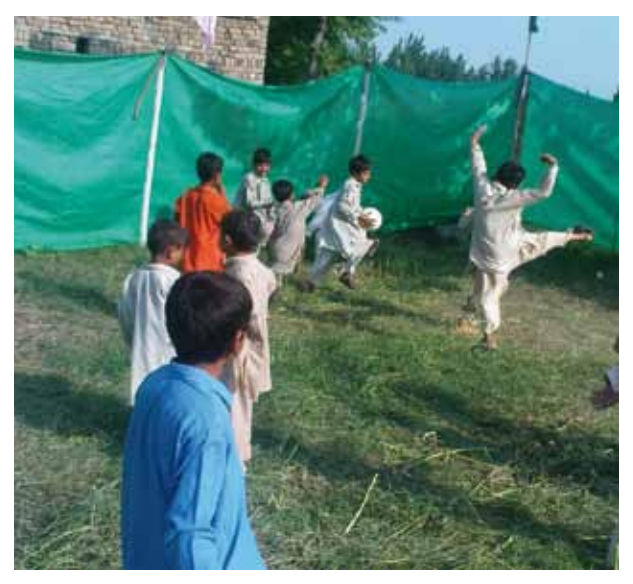
Internally displaced boys playing in a fenced-off recreation area in a camp in Swabi District, KP.

IRC protection teams found a case in which the father sent his eldest son to the brick kilns for bonded labour, because "the family couldn't accommodate him; they were already poor."