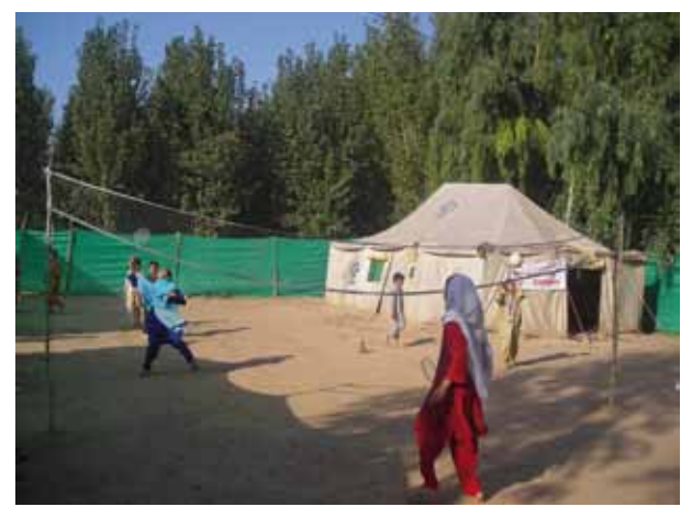
Internally displaced girls playing in a fenced-off recreation area outside a child-friendly space at a camp in KP. ( Photo: Mohammed Imtiaz Ahmed/SPARC, October 2009 )

The Emergency Shelter and Non-Food Items Cluster found ways to address some of the shelter issues in camps. Agencies used netting to provide shade above tents, replaced ordinary tents with all-weather tents, and reinforced existing tents with additional insulation. Agencies worked to create culturally-appropriate, restricted spaces outside for males and females, and to build external walls with sheeting to increase privacy in keeping with cultural traditions. These measures helped ameliorate the conditions in the tents and provide children with increased freedom of movement.