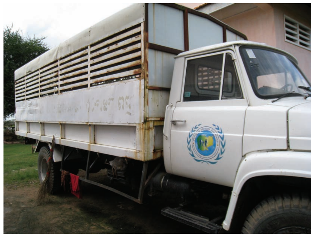
Social Affairs truck used to round up groups considered "undesirable" to take them to Social Affairs centers around Phnom Penh.

Treated with contempt, people who use drugs are routinely denied basic rights when arrested. Teap, who is 14, reported being beaten and electrocuted in police custody in order to extract a confession.