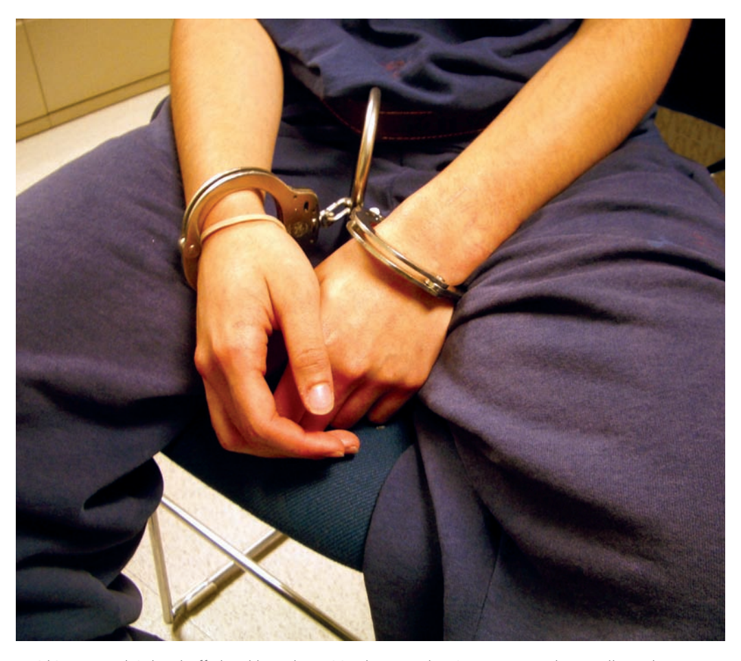
A girl in New York is handcuffed and bound, awaiting her court hearing. In New York, as well as other states in the US, juvenile girls and boys are locked up in prison-like facilities, and excessive use of a face-down 'restraint' procedure in which girls are thrown to the floor, often causing injury, have been documented, as well as incidents of sexual abuse, and inadequate educational and mental health services.

no access to rehabilitation or any educational programming since such programmes are used for those who will be leaving incarceration. The effect of being sentenced to die in prison is devastating: