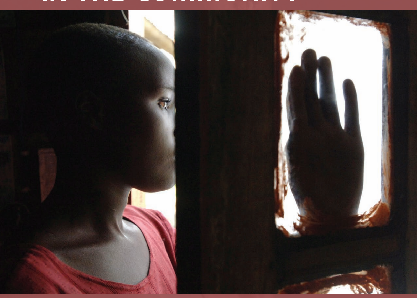
Providence, 16, was raped in a refugee camp near Goma after fleeing her home in North Kivu, in the DRC. The UNHCR estimates that there have been nearly 400,000 displaced in North Kivu since the start of 2007.