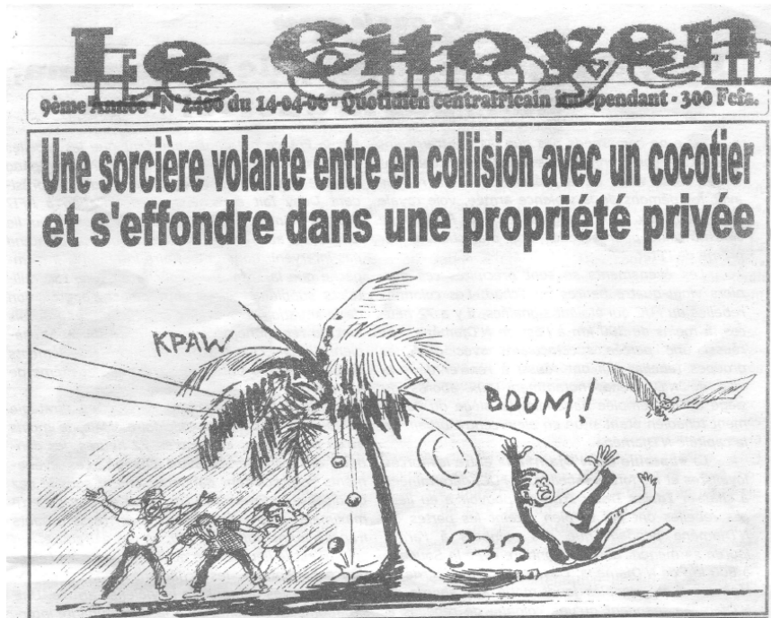
A flying witch crashes into a coconut tree and falls onto private land Front page of the Central African daily newspaper, Le Citoyen N°2400, 14 April 2006

these days other “products”, such as aeroplanes or mobile phones, also make up the witchcraft imagination.