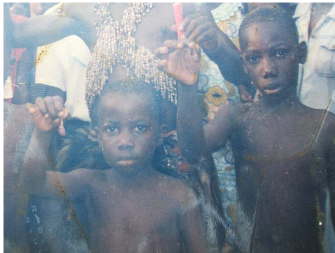
Children showing the witchcraft substance allegedly removed from their abdomens. (Bangui, CAR)

In the Central African Republic, I witnessed treatment that required an operation. Since witchcraft is defined as a substance in the child's abdomen, the nganga makes an incision in the child's belly, using an unsterilized knife, and cuts out a small piece of intestine, which symbolizes the witchcraft. As a result, the children are "cleaned".