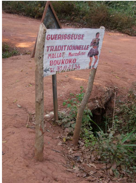
Sign for a traditional healer in Mbaïki (CAR)

A number of traditional healers, 73 or traditional doctors, called nganga in Central Africa, or inyanga or sangoma in South Africa, 74 also claim to be able to combat the occult forces of the invisible world. In the same way as the pastors and prophets, traditional healers take advantage of the ever-present witchcraft discourse. In addition to healing “natural” illnesses with medicinal plants (hence the title, médecin traditionnel ), they also offer to heal “witchcraft-related” illnesses. Moreover, they also have the gift of clairvoyance, which enables them to detect witches. Both urban and rural traditional healers are increasingly visible, advertising their “hospitals” with large signs that promote their expertise in combating the “modern” forms of witchcraft.