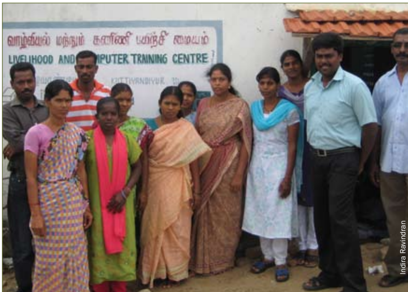
OfERR staff with Indian volunteers outside a community centre in Nagapatinam district.

disaster management, first-aid training, and legal and human rights awareness, among others.