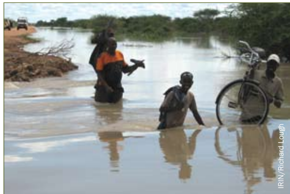
Floodwaters at Dadaab, Kenya, November 2006.

The document of 'Comments and Proposed Revisions to the Negotiating Text' prepared by the Chair of the UNFCCC Ad Hoc Working Group on Long-Term Cooperative Action is available at http://www.unhcr.org/4a408cc19.html ; the revised draft negotiation text, as of July 2009, is available at http://unfccc.int/resource/docs/2009/awglca6/eng/inf01.pdf