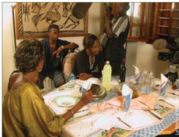
An episode of a UNHCR-produced soap opera promoting tolerance in Côte d'Ivoire won the Audience Award at the 7th Abidjan FICA film festival (Festival international du court métrage d'Abidjan) in the short features category. Directed by young Rwandan refugee Joseph Mouganga.

Engaging refugees in peace talks can strengthen the peacebuilding