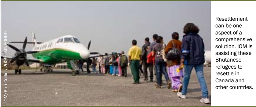
Resettlement can be one aspect of a comprehensive solution. IOM is assisting these Bhutanese refugees to resettle in Canada and other countries.

and mediation efforts, transitional justice and reconciliation initiatives, building peace enforcement and peace operations capabilities, promoting civilian protection strategies, and reducing the impact of landmines, small arms and light weapons.