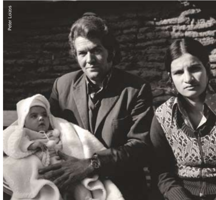
Argaki couple with their baby, 1975.

Although official rhetoric from political leaders and school teachers