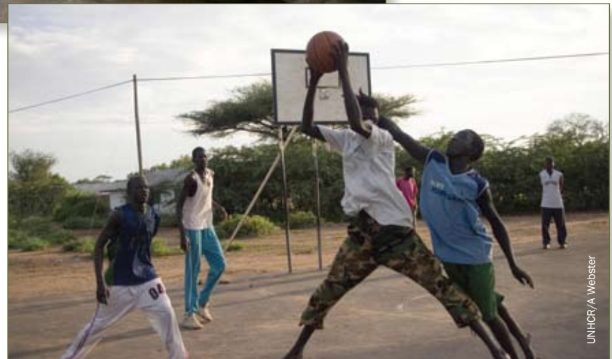
Kakuma refugee camp

At that time, it was a frequent experience to hear at night-time the cry of " Leba, leba! " (Thief, thief!) Sudanese refugee minors (the 'Lost Boys' now resettled in the US) used to raid the Ethiopian community at night. Everybody chased the thieves in the pitch darkness but those Sudanese minors were rarely caught. What amazed us were the reactions of those who had been chasing the thieves. When they returned, they would gather in small groups to exchange experiences: the one who caught the neck of his neighbour, mistaking him for a thief; the one who couldn't find the door of his own house to go out to join the chase; the one who