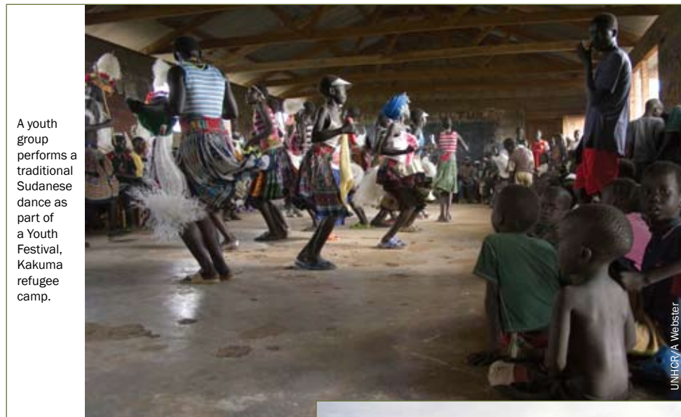
A youth group performs a traditional Sudanese dance as part of a Youth Festival, Kakuma refugee camp.

Based on this belief we decided to find ways to help our fellow refugees.