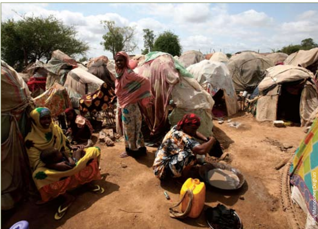
Displaced woman and children at Sheikh Omar camp in Jowhar, Somalia.

Thus, the common narratives of the situation in the country of origin as one of permanent crisis and upheaval, and the refugee situation as one of protracted stasis, which can be challenged on closer analysis, seem to have shaped international responses in important ways. Recent events in the Somali regions throw some light on this. The violence following the ousting of the Islamic Courts and the arrival of the (then) Ethiopian-backed Transitional Federal Government (TGF) in 2007 prompted a massive displacement