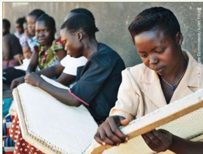
IRC training programme, Kitgum IDP camp, northern Uganda.

3. 'Youth Microenterprise and Livelihoods: State of the Field' Lessons from the 2007 Global Youth Microenterprise Conference, Making Cents International, Jan 2008. http://tinyurl.com/MakingCents08