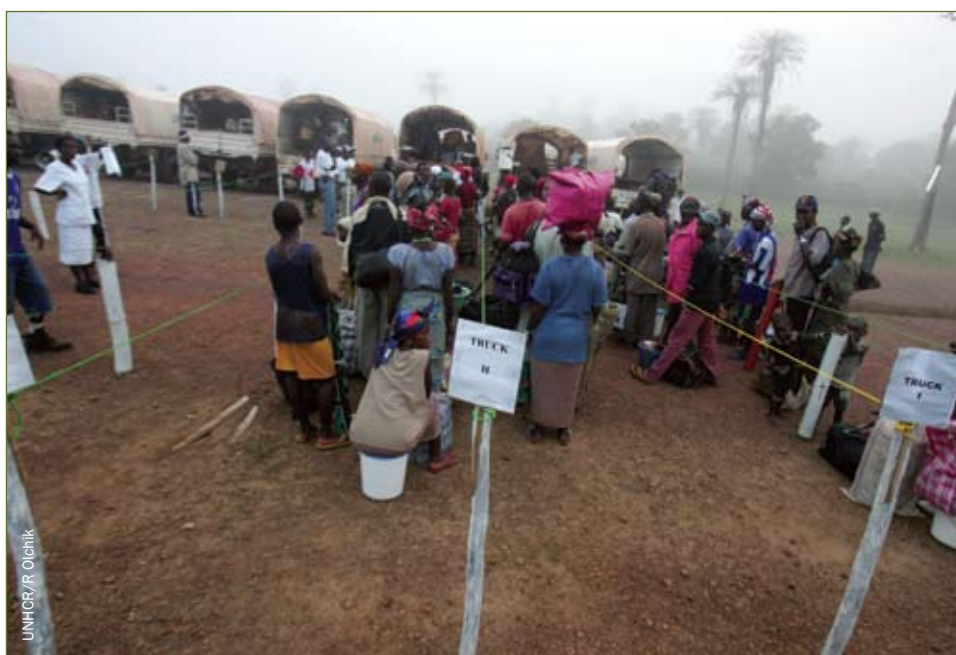
Voluntary repatriation of Liberian refugees from Sierra Leone, December 2004.