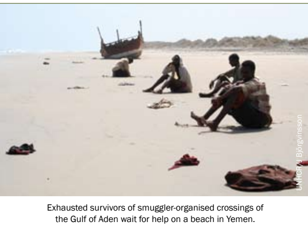
Exhausted survivors of smuggler-organised crossings of the Gulf of Aden wait for help on a beach in Yemen.

In Southern countries refugees have often no opportunities for legal mobility and this lack of legal opportunities diverts the flows to irregular channels, meaning that in many cases secondary movements are irregular almost by definition, as a result of existing policies. Therefore, in practice, preventing irregular secondary movements means preventing any movement.