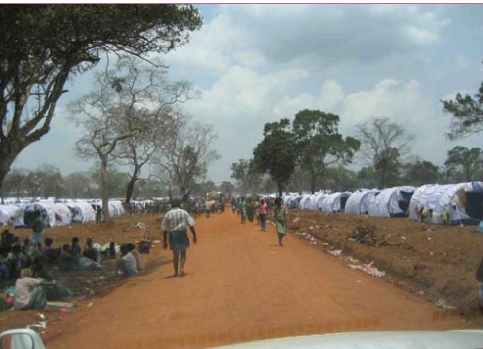
Menik Farm in Vavuniya District, Sri Lanka.

Shortages of food and water, as well as restrictions on movement between