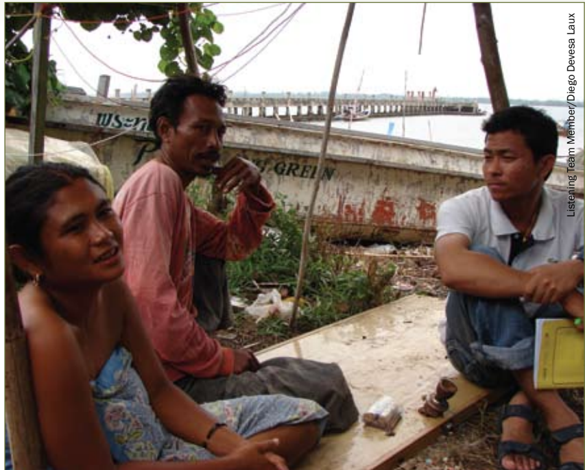
Listening Exercise Thailand 2007

A number of people in Cambodia emotionally discussed the abuses they witnessed or endured as refugees in camps in Thailand during their civil war, including physical abuse, trafficking, rape and sexual