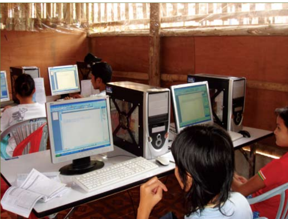
ZOA computer class, Mae La Camp, Mae Sot, Thailand. May 2008.