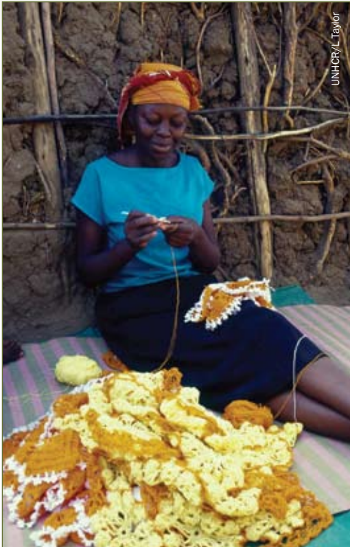
Member of a women's group crocheting, Kakuma camp

Refugees who were followers of the Ethiopian Orthodox church decided to mobilise refugees to build a church large enough to accommodate everyone. Within two years, with financial support from abroad, refugees built two sparkling churches. Youngsters and many older people were more than willing and ready to help build the church. Church activities and the number of church-goers grew each day. More importantly, refugees who dedicated their time and energy to this work found that they had bigger appetites for whatever food was available and greater reserves of physical energy. They felt pleasantly tired after their work and slept deeply at night. They were completely changed persons.