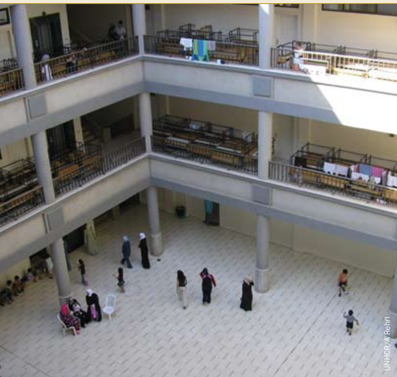
Some 500 Lebanese refugees fleeing violence sheltered in Al-Shariya High School, South Damascus, Syria.

Collective centres are usually portrayed as a short-term measure during mass displacement, often in urban