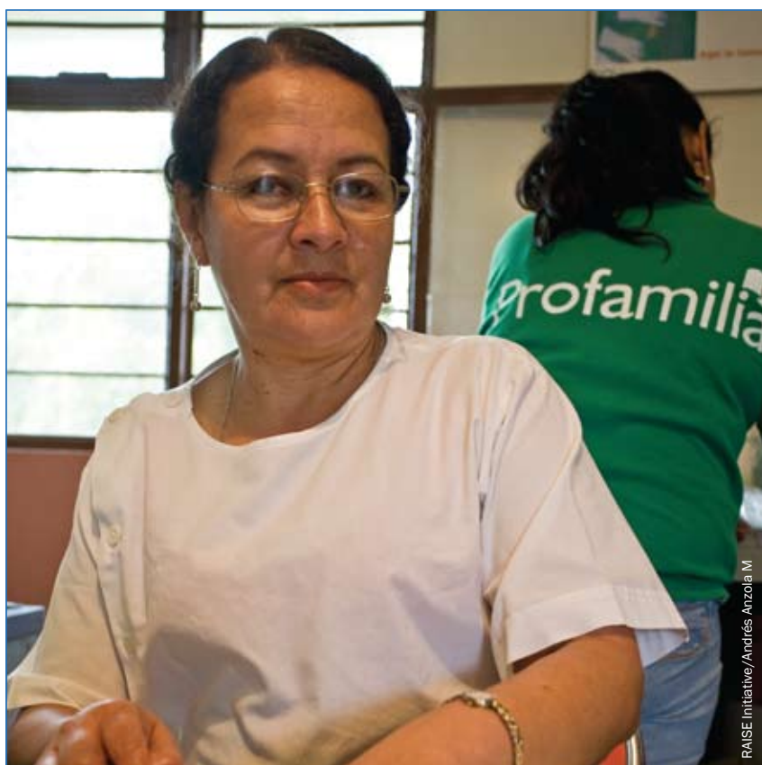
Profamilia staff providing sexual and reproductive health services to displaced communities in Colombia

In rural areas, IDPs' health issues are exacerbated by a lack of access to services. IDPs are widely dispersed and, in the Pacific region especially, the health service infrastructure is minimal. Afro-Colombians and indigenous Colombians comprise a disproportionate number of the displaced. Recognising that these populations in particular lack economic resources and are almost entirely cut off from access