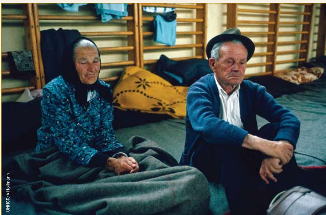
Refugees from Bosnia and Herzegovina in a sports centre in Sremska Mitrovica, Serbia.