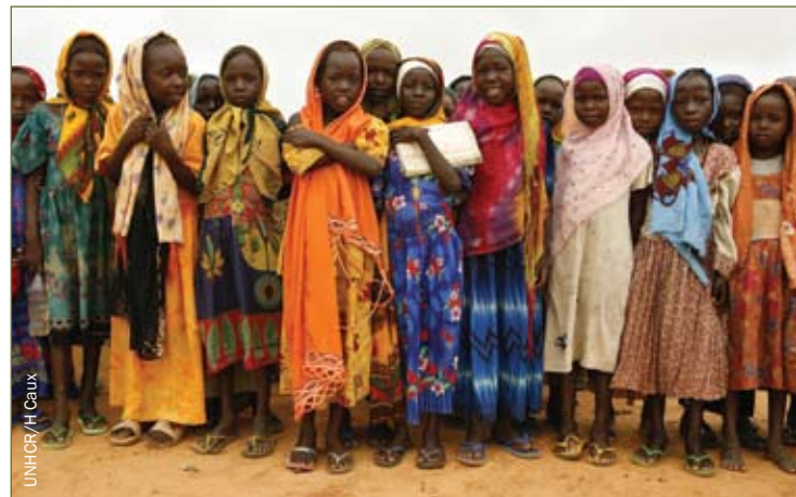
Young Darfuri refugees gather in Djabal camp, Chad, to register for the next school year.

Networks and structures have changed to the point that confidence about the future is not assured and 'warehousing' – "the practice of keeping refugees in protracted