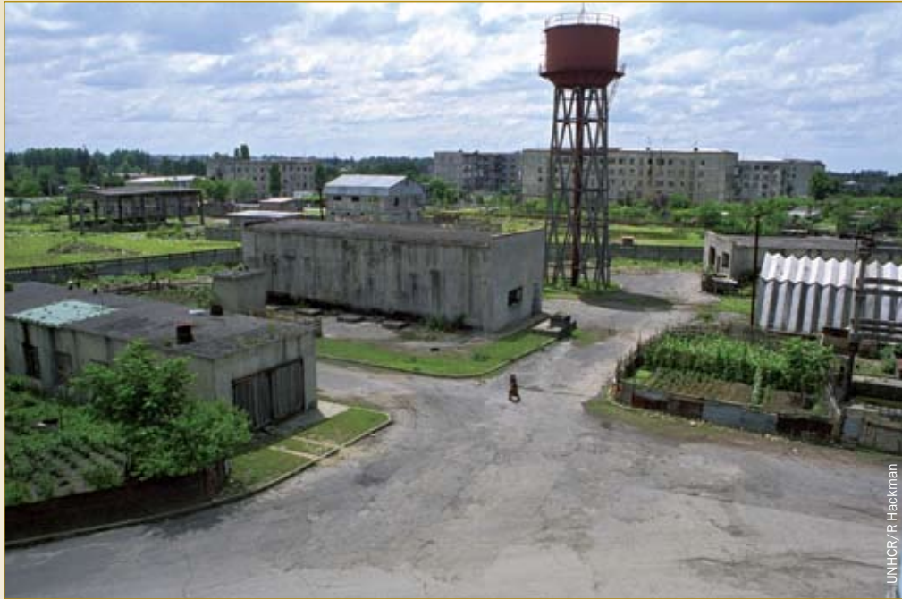
IDP accommodation near Zugdidi, Georgia.