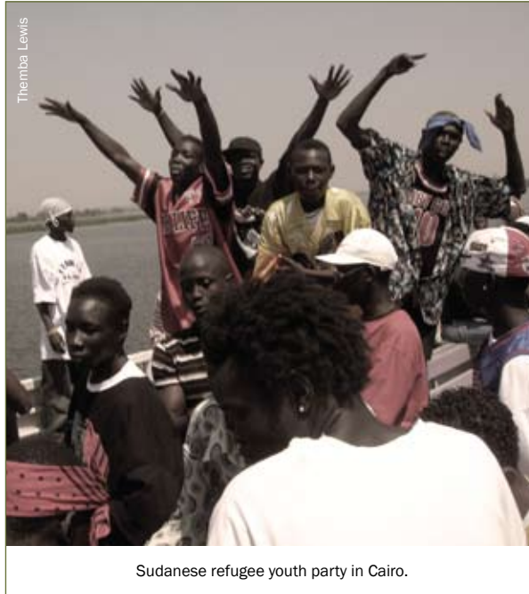
Sudanese refugee youth party in Cairo.

to affect their circumstances positively. As various efforts to change this have repeatedly failed, disenfranchisement has become entrenched and intractable. This may encourage the embrace of opposition as lifestyle. In a very real sense, gang membership in Cairo represents an assertion of control and pride in the face of circumstances of displacement that often suggest the opposite. Gangs provide an