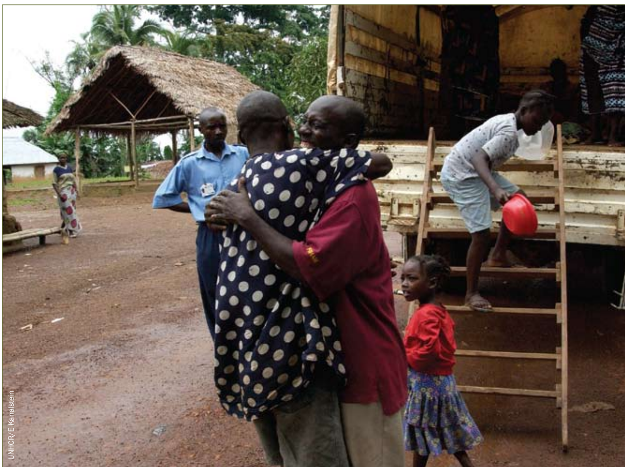
Voluntary repatriation of Sierra Leonean refugees from Liberia, July 2004.

Between 1993 and 2007 more than 9.2 million people across Africa were able to return to their country of origin. Decreases in total refugee populations are also a result of third country resettlement, with over 182,500 people resettled in the same period. Opportunities for local integration, on the other hand, which had been a solution for many refugees