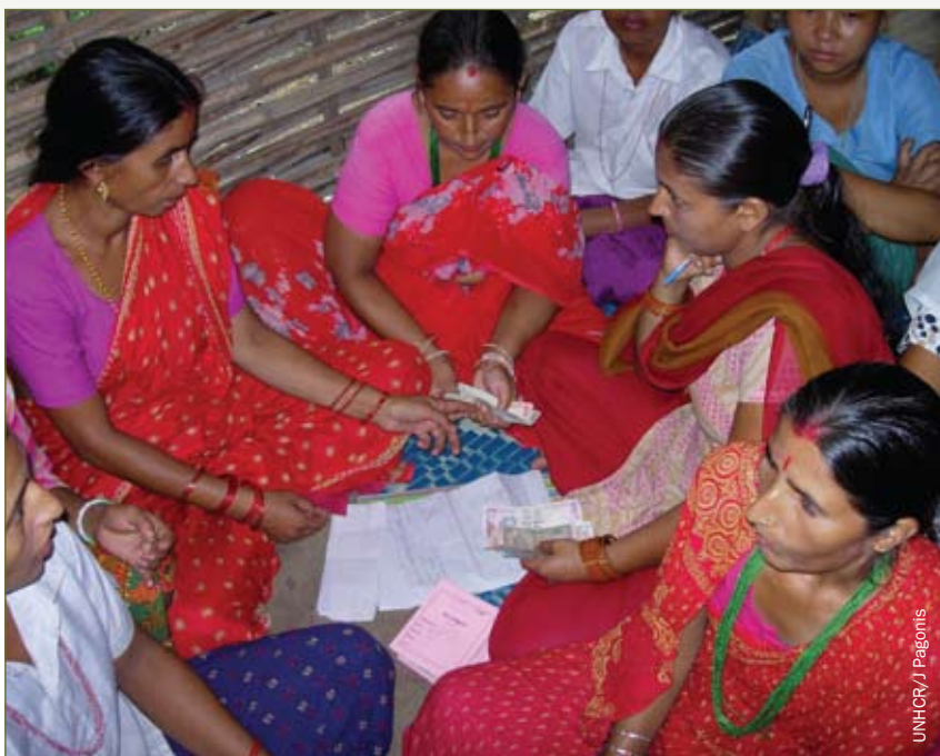
Bhutanese refugee women in Timai camp, eastern Nepal, participate in a microcredit scheme, which offers loans to start small businesses.

there are many occasions when they need sums of cash greater than they have to hand, and the only reliable way of getting hold of such sums is by finding some way to build them up from their savings.” 3 Appropriate financial services for the poor, including protracted IDPs, should therefore promote savings as a means to build wealth and to make these lump sums available when needed in a safe, convenient, flexible and affordable way.