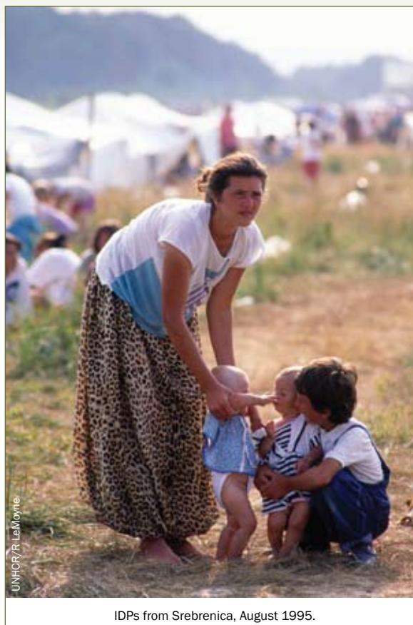
IDPs from Srebrenica, August 1995.

Supporting national efforts to resolve protracted displacement nevertheless will require a more comprehensive international effort. In BiH, UNHCR has been working intensively to