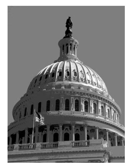
To ratify a treaty, the U.S. President signs the treaty and the Senate passes a resolution consenting to make the treaty part of U.S. law.

Treaties create human rights standards, but they also create ways in which those standards are enforced. In order for there to be treaty enforcement, governments have to sign and ratify a treaty. For ratification