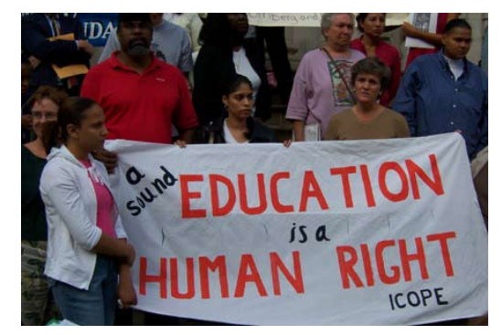
Independent Commision on Public Education, www.icope.org, Rally at City Hall in New York, NY.

Organizing and Messaging: Human rights speak to the inherent dignity of every person and can be used to mobilize people and develop leadership in the community. The human right to participation recognizes that people have a right to be heard by the government and to have a voice in community decisions. Human rights trainings or workshops can help organizers inform their communities about their rights and empower them to take action. Many organizers take advantage of international human rights days of action, like Human Rights Day on December 10, to mobilize people and present their recommendations for change. Organizers can use mock human rights tribunals or hearings to present testimonies from community members to the public.