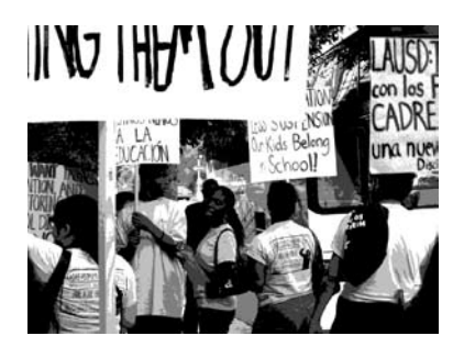
Students rally with CADRE to change discipline policies in South Los Angeles.