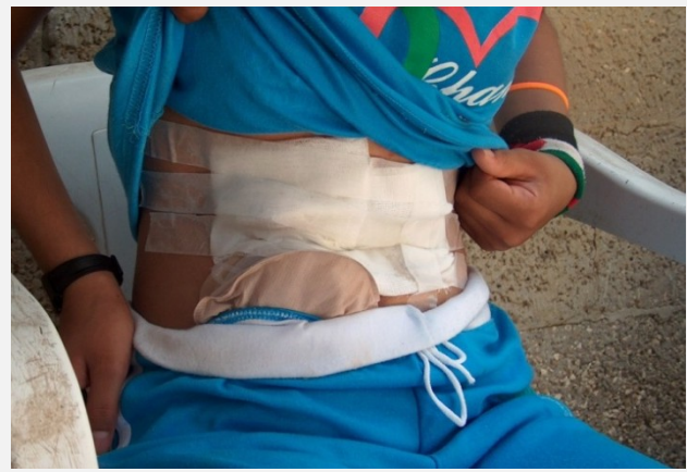
Rana's bullet injury, abdomen. August 2007.