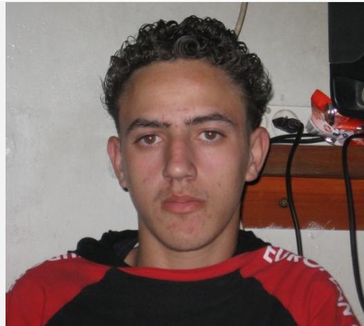
Ameed shortly after the incident.

Affidavit taken from victim by: DCI-Palestine