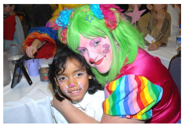
Face Painting activity at the Christmas Show

oyal to its tradition, the Organization for the Protection of Children's Rights (O.P.C.R.) welcomed on December 19th and 21st more than 700 children, aged between 6 and 8, to its fabulous Christmas Shows. It is in the O.P.C.R.'s mandate to invite underprivileged children from