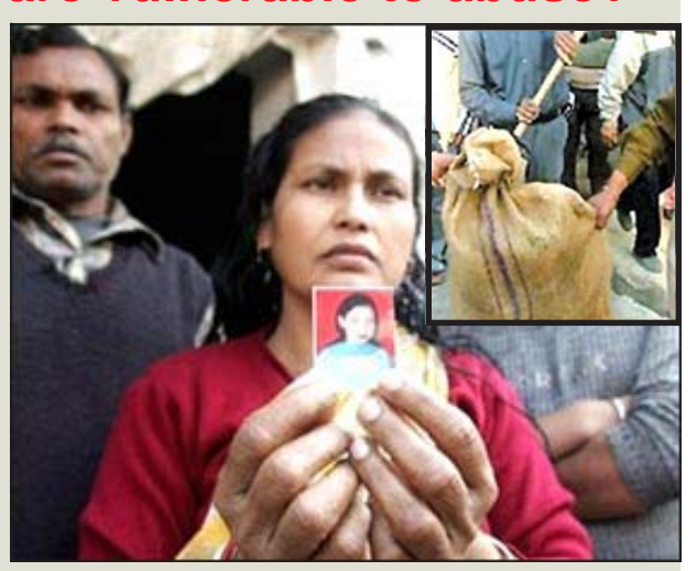
The Family of one of the missing children flash the photo of their child; INSET: 40 polyurethane bags containing body parts and organs of children were recovered by Police in the drain of the accused

A wave of revulsion swept through the country after details of the mass killings in Nithari village of Noida - a suburb of the Indian capital, Delhi - unfolded like one grotesque sequel after another of a horror film. Murders involving much larger numbers is not so rare in India, but these killings evoked a different response alto-