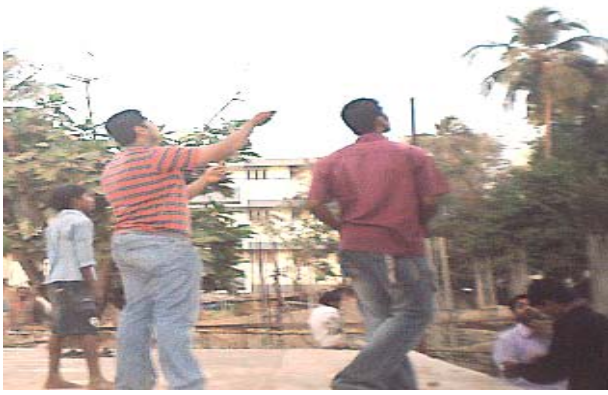
Children and Volunteers try their hand at flying kites in the Kirti College Campus

Since the festival is celebrated in the mid winter, the food prepared for this festival are such that they keep the body warm and give