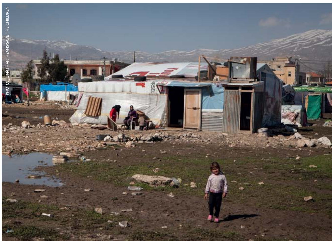
A refugee settlement near the Syrian border

Save the Children is working with UNHCR and other UN agencies, and the host governments in Jordan, Lebanon, and Iraq, to ensure that all vulnerable groups get the assistance and protection they need. We are providing support to refugees (whether registered or unregistered) and host communities, as well as non-Syrians fleeing the country, such as Palestinians and Iraqis. As of March 2013, we had provided much-needed assistance to more than 240,000 people across the region, including shelter, food, and protection for children.