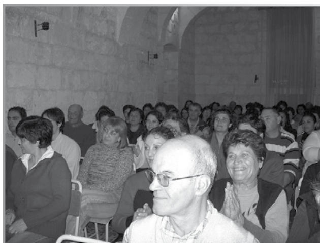
Parents from Sannat during a talk given by the Commissioner for Children

also had the opportunity to sit in on meetings with the school councils, and to attend special school assemblies which were organized around her visit.