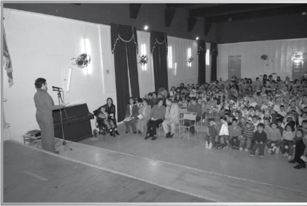
The Commissioner for Children addressing students of Profs. Guze Aquilina Primary School in Sannat, Gozo