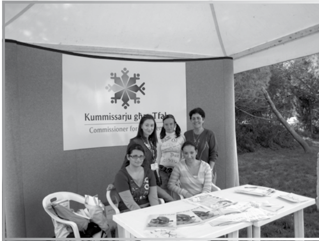
Young volunteers at World Children's Day

In speaking of the situation of children in Malta with regards to child labour, the Commissioner mentioned the lack of information and statistics pertaining to children who habitually do not attend school for unjustified reasons. This increases the difficulty in obtaining a clear picture of how many of these children do not go to school due to the fact that they are occupied in undertaking work which is illegal for their age. This information and research is necessary in order to identify why children and young people in Malta work. The Commissioner for Children stated that such work denies children of their childhood, and in this respect all relevant authorities have a responsibility to ensure that children's fundamental rights are observed.