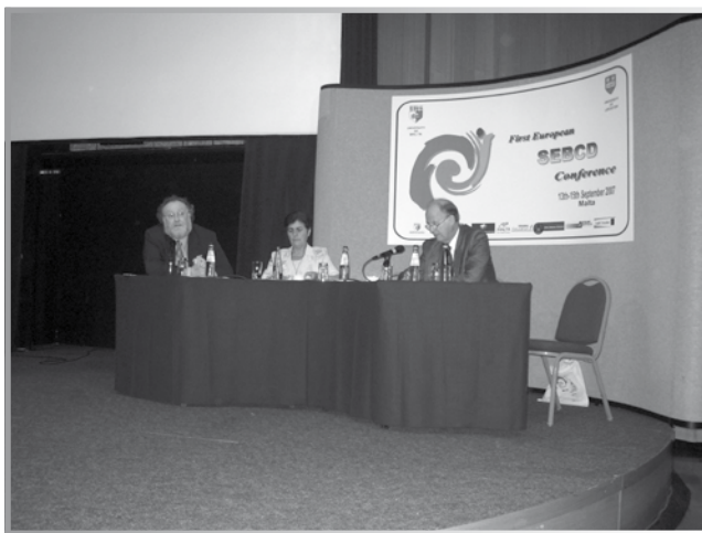
First European SEBCD Conference

In view of the extensive study and work carried out by the Office of the Commissioner for Children in previous years, it was felt that a response to the needs of these children is well overdue.