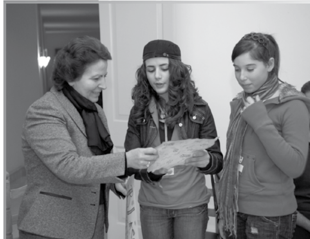
The participants of the Rights 4U course had the opportunity to discuss what they had learnt in the course with the Minister for Gozo, after which they presented her with a handmade souvenir of the event

The Bishop for Gozo, as well as the Minister responsible for Gozo, each paid a visit to the group of young people. The Bishop ate lunch with the