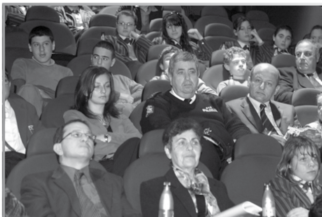
The Commissioner for Children present at the launch of a six month awareness campaign, on the new legislation regulating the consumption of alcohol by youths under the age of sixteen

The Commissioner for Children showed support to an educational campaign launched by the Ministry for the Family and Social Solidarity, which aimed to enforce the law prohibiting the consumption, possession, and buying of alcohol by minors less than sixteen years of age. The law came into force in July 2007, and the Ministry for the Family and Social Solidarity launched an Inter-Ministerial Focus Group to co-ordinate the six month educational campaign. Whilst this remains a very positive step, the Commissioner for Children strongly feels that this legislation should be extended to persons under the age of eighteen years.