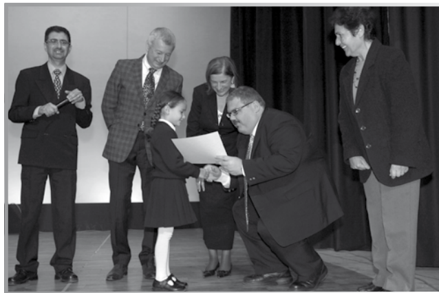
Ekoskola Annual Seminar

Lastly, as part of the Ekoskola initiative, the Commissioner for Children was also present at the Ekoskola Annual Seminar held at St. Monica School in Gzira. The project promotes environmental education and awareness, and the session allowed primary school students to have a meeting with Xummiemu about waste management, whilst secondary school students reflected on their responsibilities towards the government.