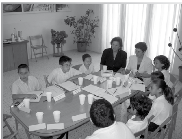
A meeting with the Student Council at St. Bernadette Primary School

Some of the schools visited took the liberty of organizing a programme of events on the occasion of the Commissioner's visit. The students showed the Commissioner around the school, and also organized wonderful and spectacular play and choir performances. The Commissioner