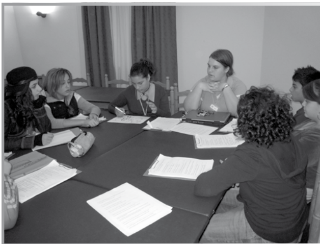
Workshops during the Rights 4U course

On the 16th – 18th November 2007, the Commissioner for Children organized a Children's Rights Course exclusively for 13 and 14 year old