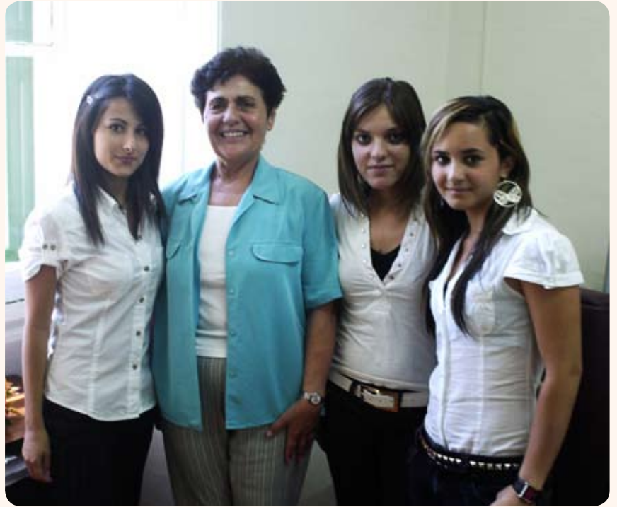
The Commissioner for Children with Volunteers from MCAST