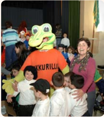
The Commissioner for Children mingles with the children of Profs. Ġużè Aquilina Primary School and Kikkurillu