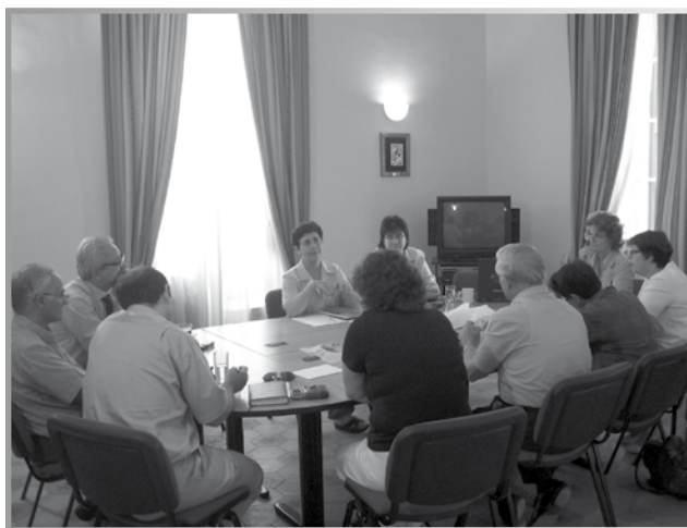
First Focus Group Meeting on Residential Care

Whilst the significant work done by such institutions is to be recognized, local, European and International qualitative research has shown that children placed in foster care fare better than those placed in institutionalized care. Nonetheless, there are by far more children who are placed in these large institutional and residential homes, as opposed to being placed in foster care given that the availabilities for the latter type of placement are still scarce.