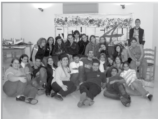
The Commissioner for Children with the participants for the Rights 4U course

At the end of the course, an evaluation exercise was carried out in which the participants were invited to provide feedback on the three-day programme. According to the feedback given by the young people who participated in the programme, this year's course was a wonderful and enriching experience to all participants. Participants particularly expressed that they enjoyed the atmosphere of unity and tolerance, sharing and friendship. They appreciated that their ideas were valued, and that they were trusted with the responsibility to work together as a team.