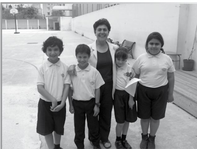
The Commissioner for Children on a school visit to St. Bernadette Primary School, with the kind ushers who showed her around

The Commissioner for Children also made regular public appearances at numerous events, participating in seminars and conferences, and giving talks and speeches upon request. School visits were also carried out this year, in line with the Commissioner's aim of making the work of her office known amongst children.