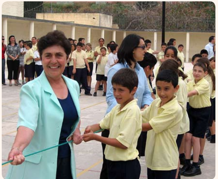
Tug of War on a school visit to St. Bernadette Primary School