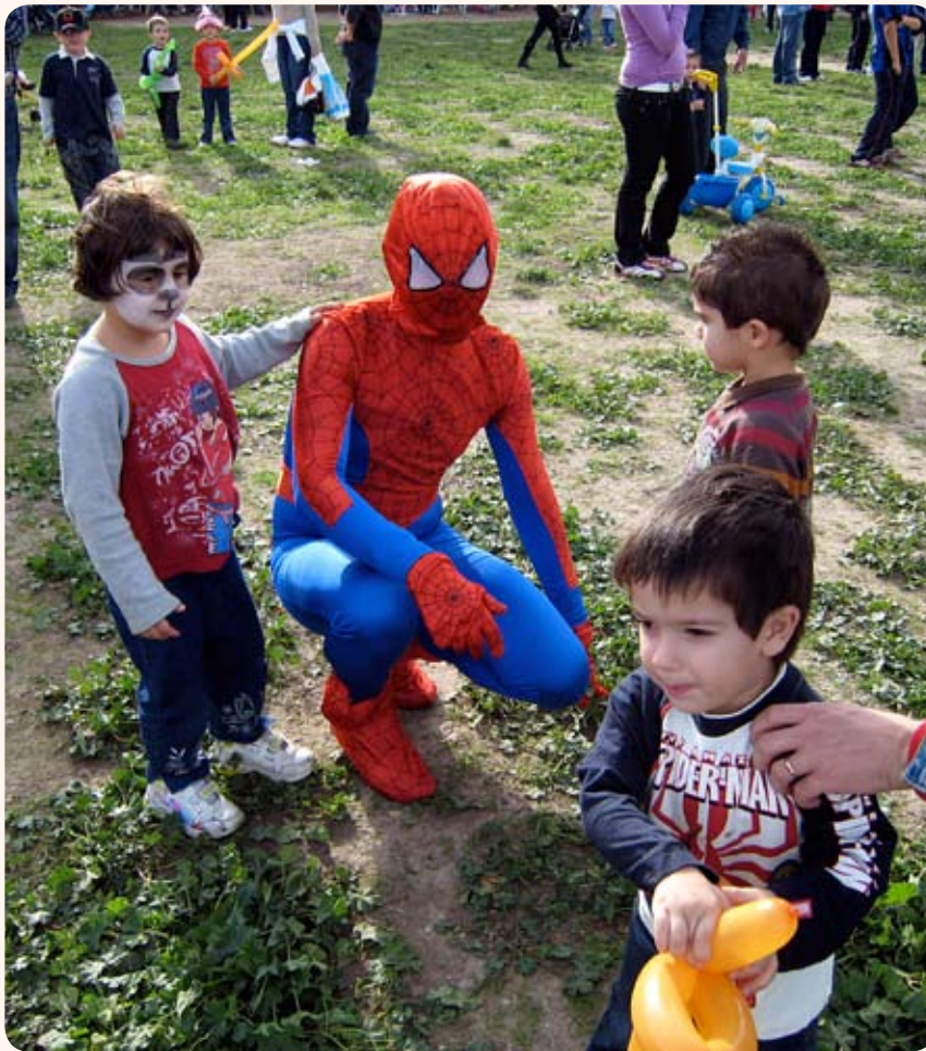
Scenes from World Childrens Day