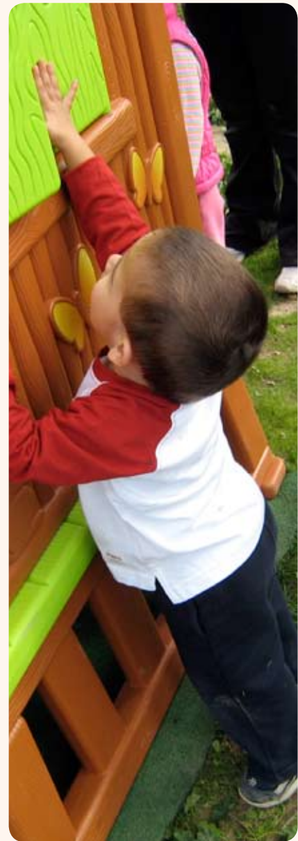
Xeni mill-Jum Dinji tat-Tfal