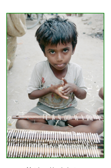
Match making industry, Shivakasi. India , © International Labour Organisation, Reproduced courtesy of the ILO, Photographer: Khemka A.