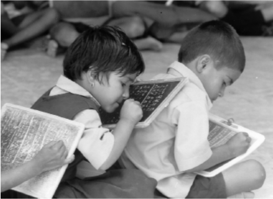
India, 2003

As one of the main donors to UNICEF, Norway encourages a strong emphasis on rights-based approaches in UNICEF’s work as well as further protection efforts in support of the UN Convention of the Rights of the Child. Norway is also an important donor to the United Nations Population Fund (UNFPA) for its work on reproductive rights.