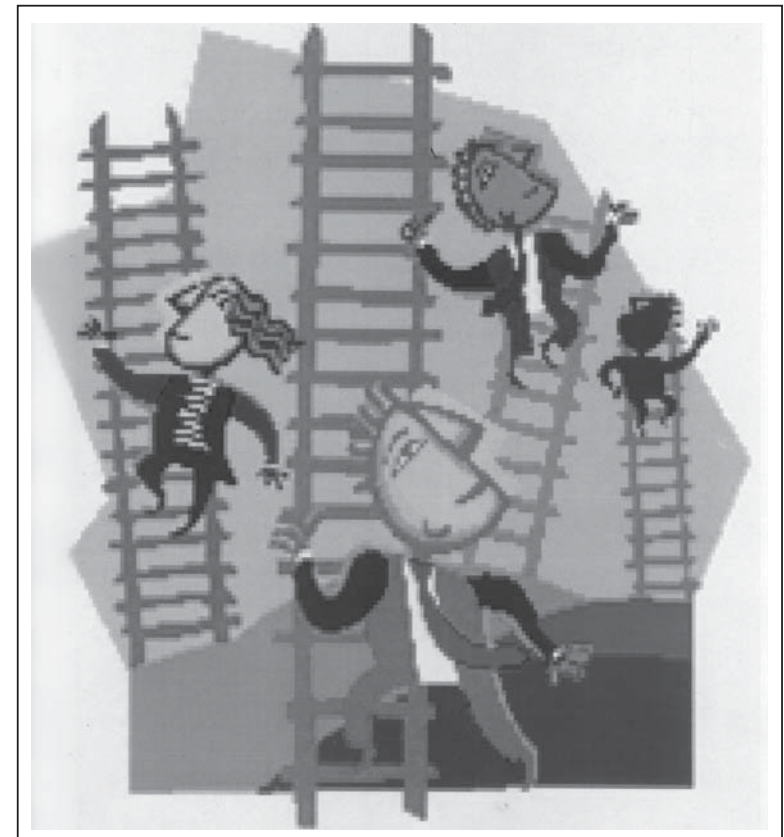
Together Everyone Achieve More

And want to wear them too, And make a future that is bright.