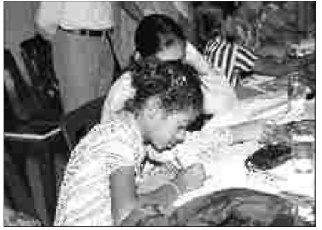
Lets write our views...