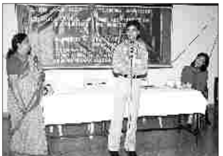
Freedom of expression