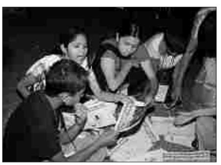
Learning team work