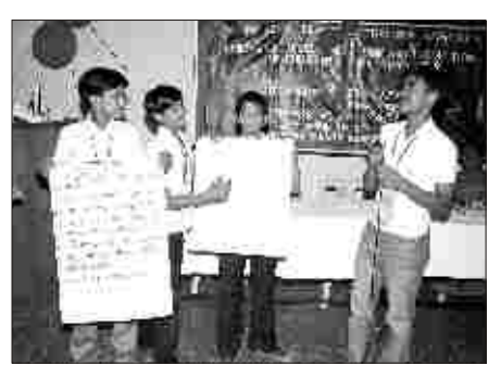
The story is our bank...