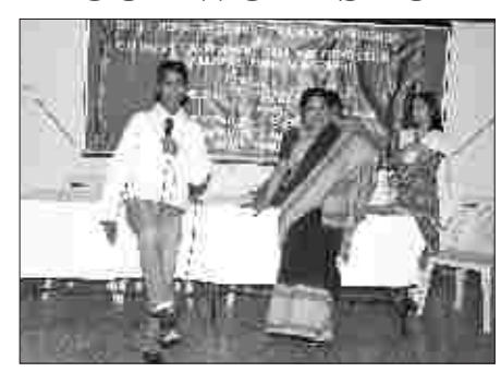
Putting a new step...