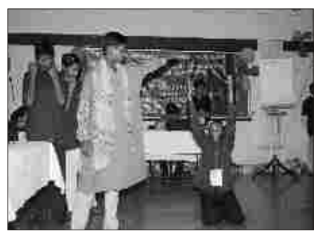
No space of "Kallu Dada"