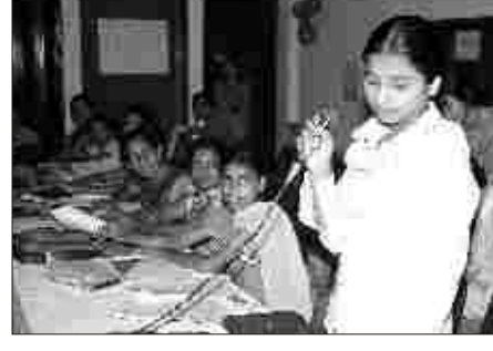
Speaking with confidence...