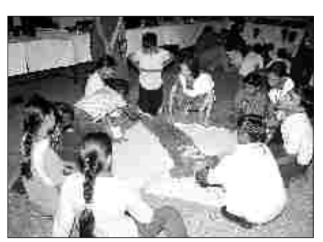
Learning while sleeping!