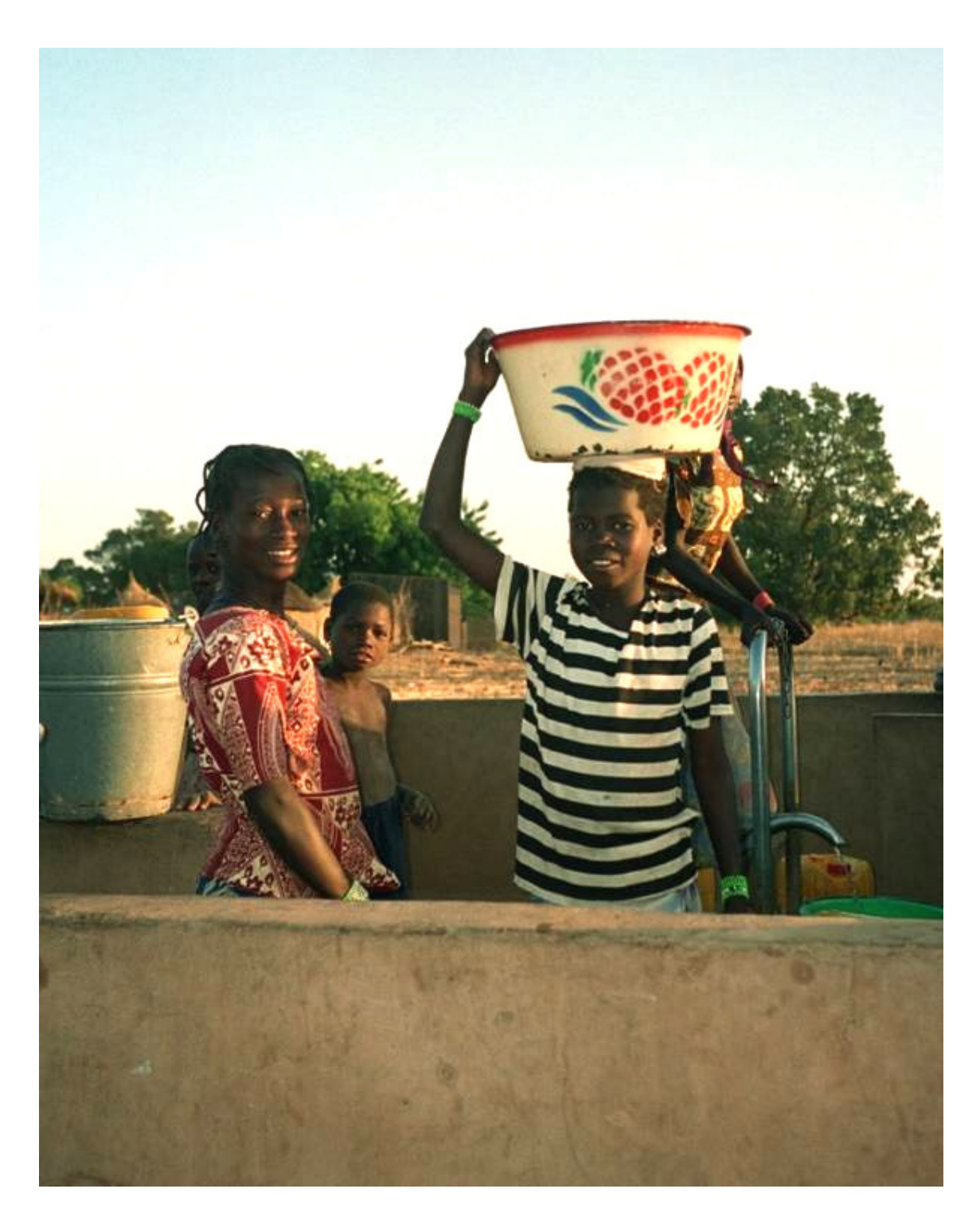
Young girls helping with household chores