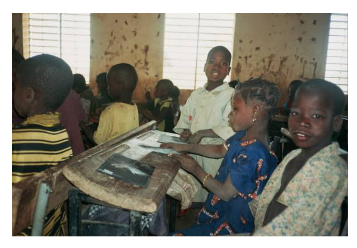
Children in school