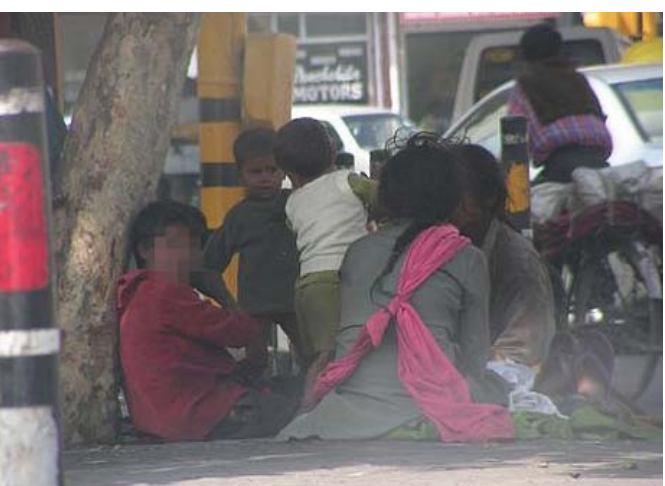
Top: Child begging in Senegal. Above: Child begging in India.