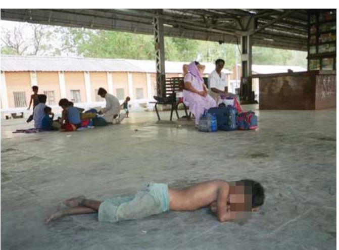
Above and top: Child begging in India.