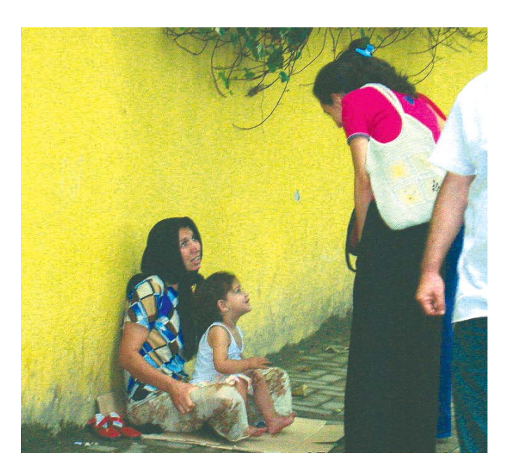
Above: Begging on the streets in Albania.

However, it is essential to recognise that children who are forced to beg by others commonly experience particularly severe abuse, which will be discussed in more detail in the next section. The major challenges in identifying children who have been forced to beg from amongst the vast numbers of child beggars must not be used as an excuse to avoid tackling these gross violations of children's rights.