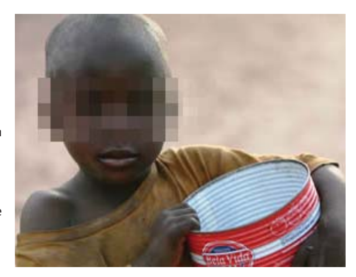
Above: A talibé, Senegal.

It is interesting to note that the forced child begging and general child begging cases uncovered in this study shared the same root causes, suggesting that there may be occasions when it is advisable to address both forms of begging simultaneously. As shown in the methods section of the introduction, in contexts such as Delhi and Albania, it can be extremely hard to identify children forced to beg by others from amongst the much larger numbers of children begging for themselves. This makes it very difficult to isolate this group for direct support. However, it is also essential that the specific needs of forced child beggars are not overlooked, especially in relation to the greater levels of violence and coercion they tend to experience. This should be borne in mind particularly for any cases where children are forced to beg by criminal gangs, as they may involve additional factors that could not be examined here.