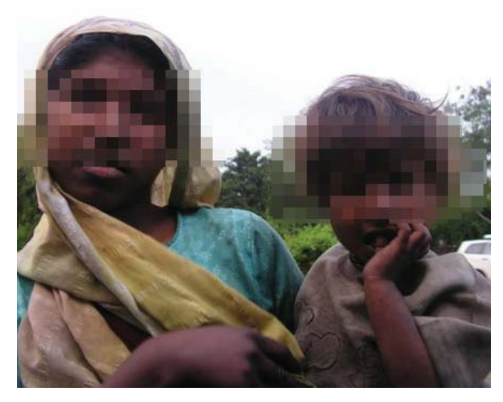
Above and top: Begging on the streets of India.