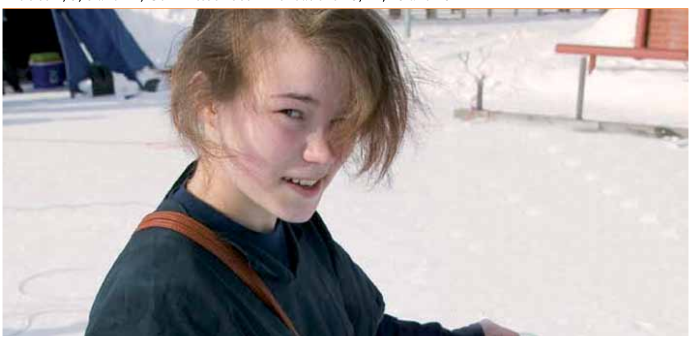
Articles 2, 3, 6 and 12; Committee recommendations 18, 21, 23 and 43